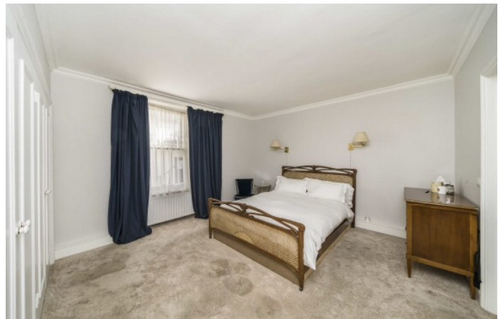
Harcourt Terrace, SW10