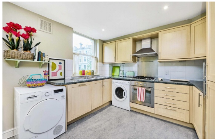
Tregunter Road, SW10