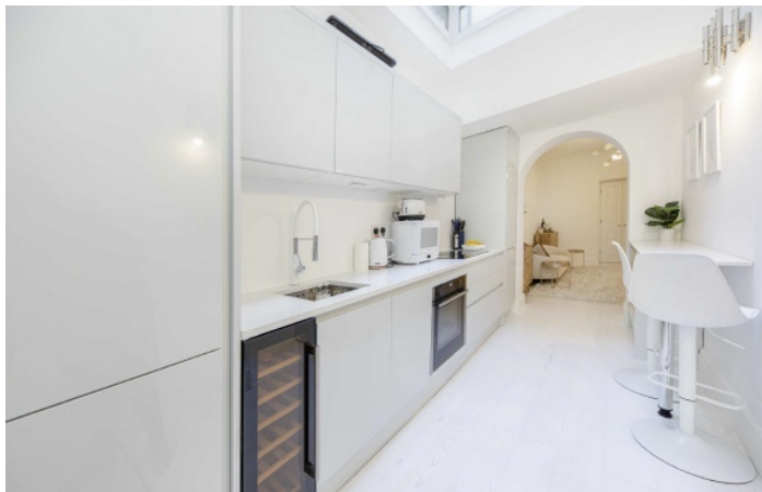
Queen's Gate Terrace, SW7