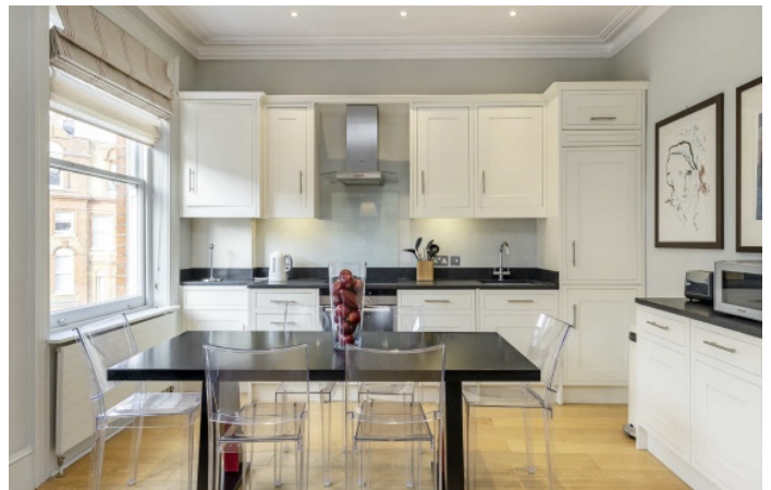
Cresswell Gardens, SW5