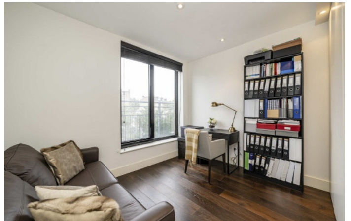
Cromwell Road, SW7