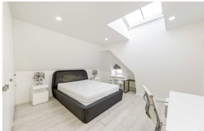
Queen's Gate, SW7