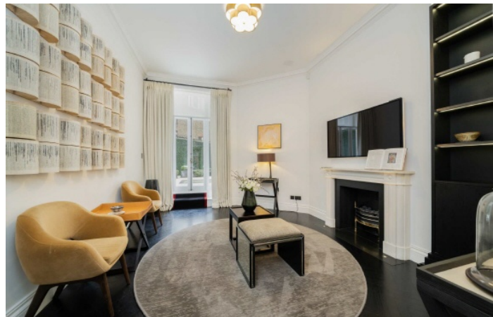
Pont Street, SW1X