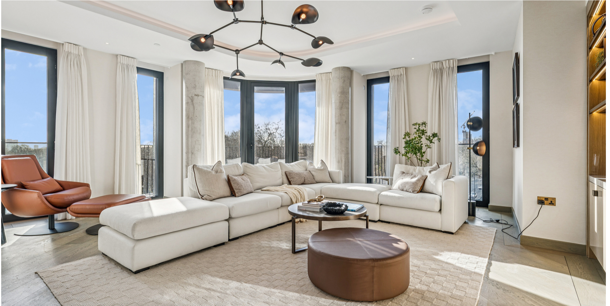
PARK MODERN, Hyde Park W2