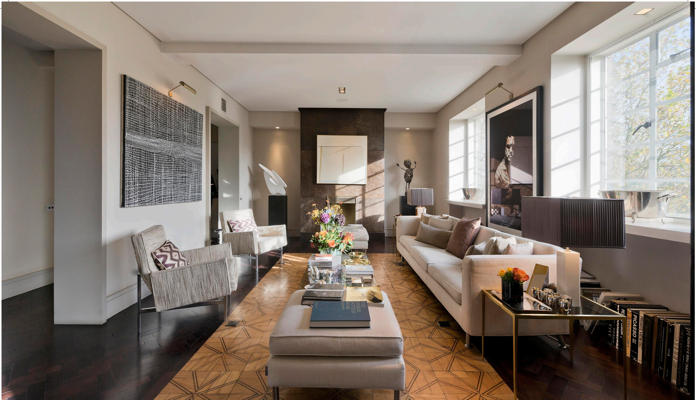
Albion Gate, London W2