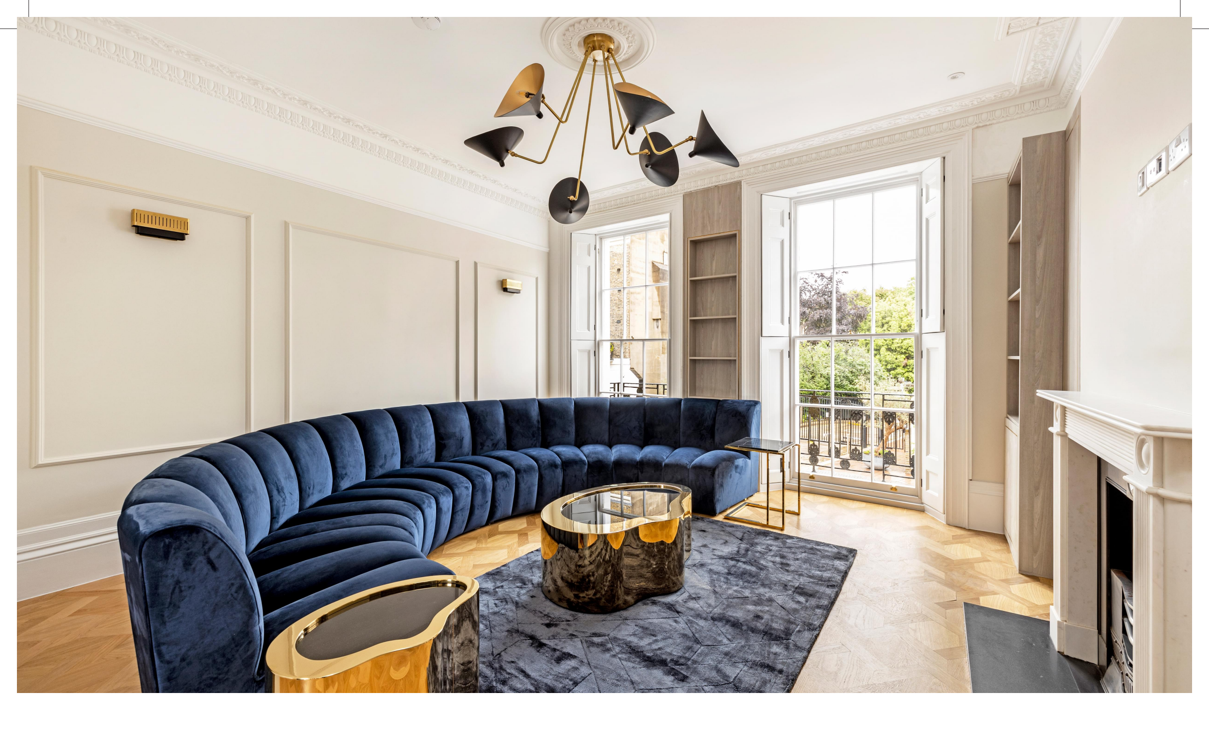
Albion Street, Hyde Park W2