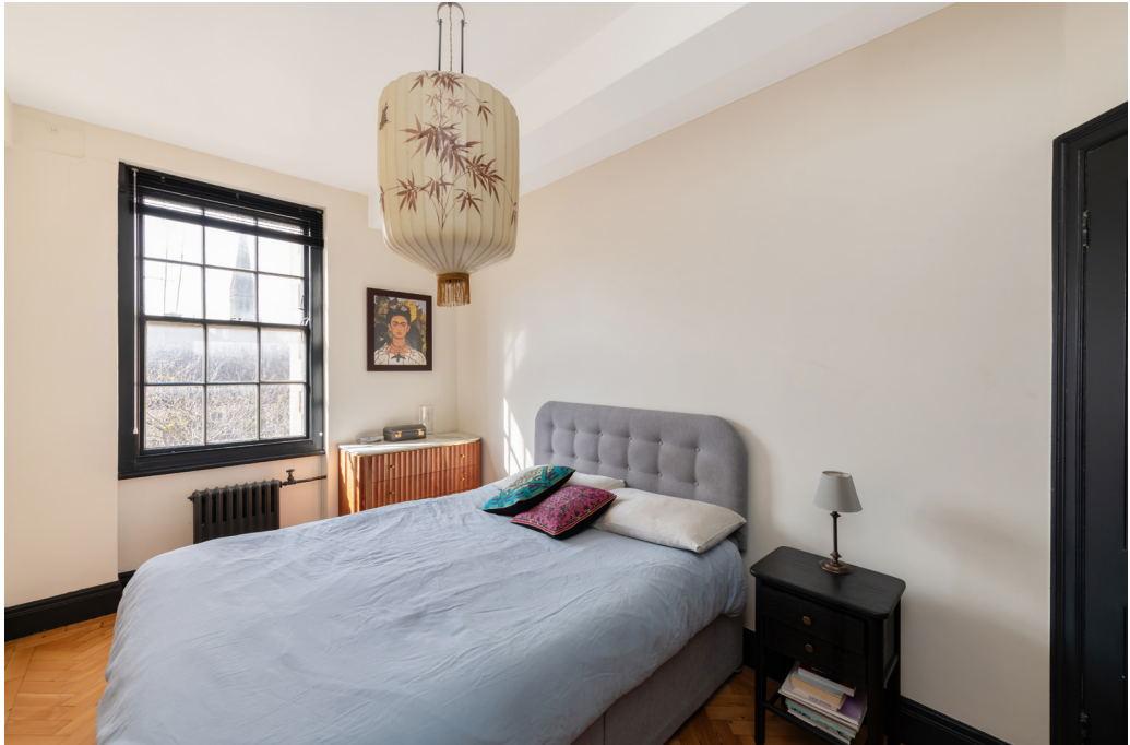
Princess Court, W2