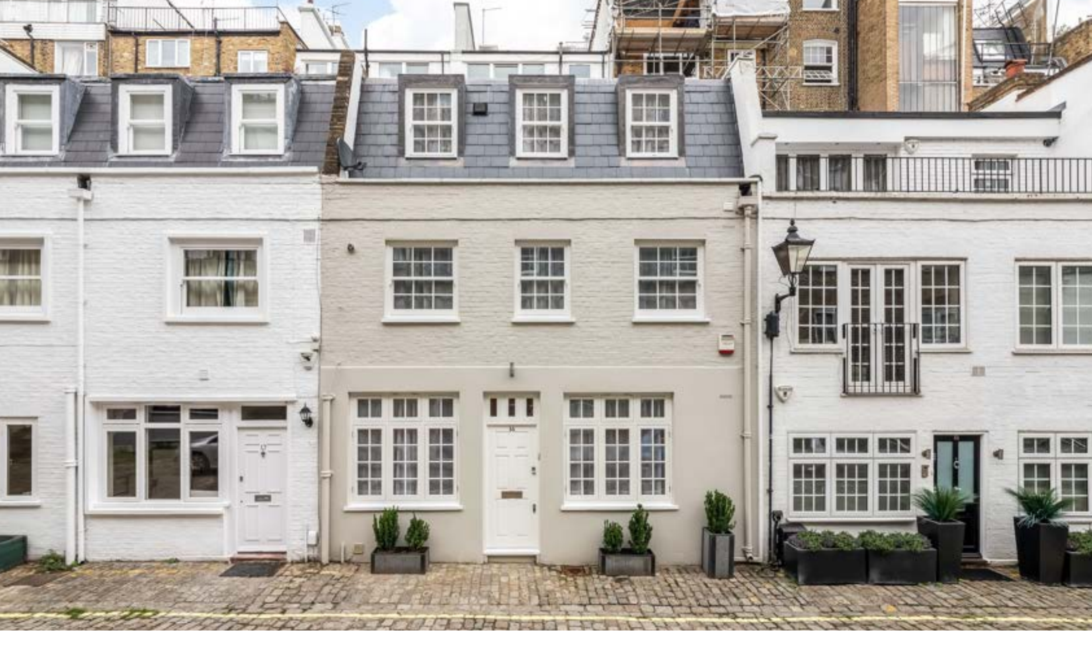
Upbrook Mews, Hyde Park W2