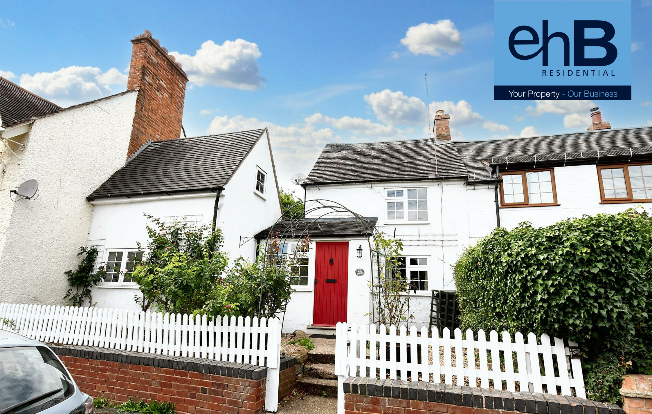
Pooh's House, Ashorne, Warwick