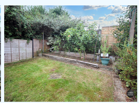
29 Green Croft, Redhill, Hereford, HR2 7NT

'Situated to the south of Hereford City, a three bedroom semi detached family home, with off road parking, gas central heating, double glazing and enclosed rear garden'