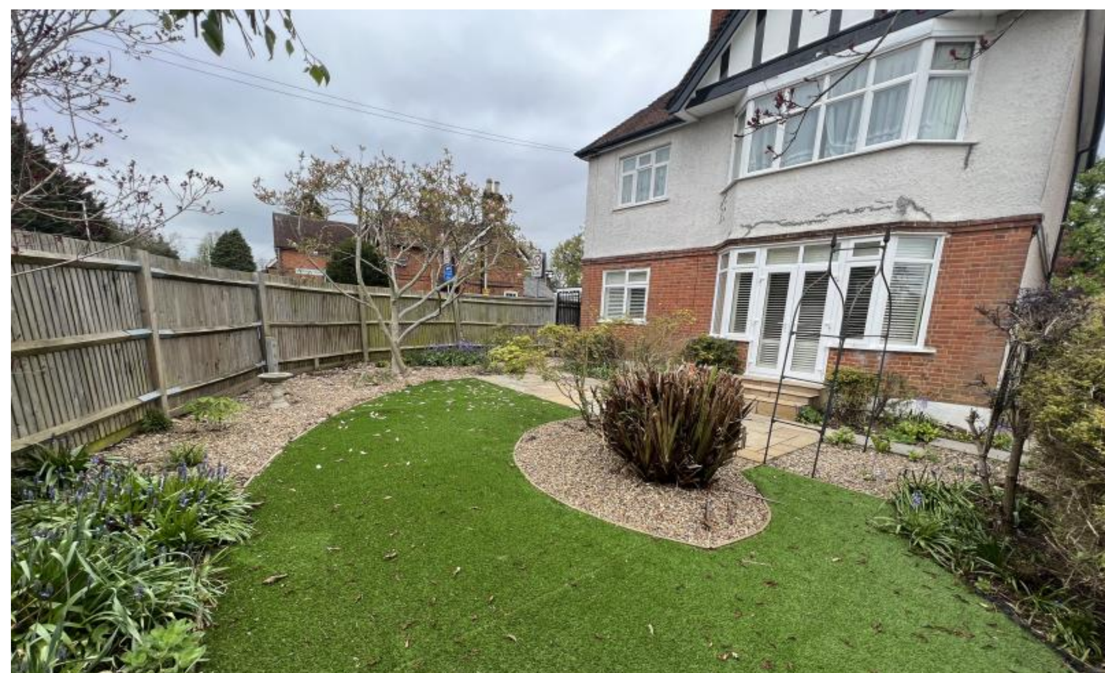
A two bedroom ground floor maisonette with parking in convenient location Kewferry Road, Northwood, HA6 2PD