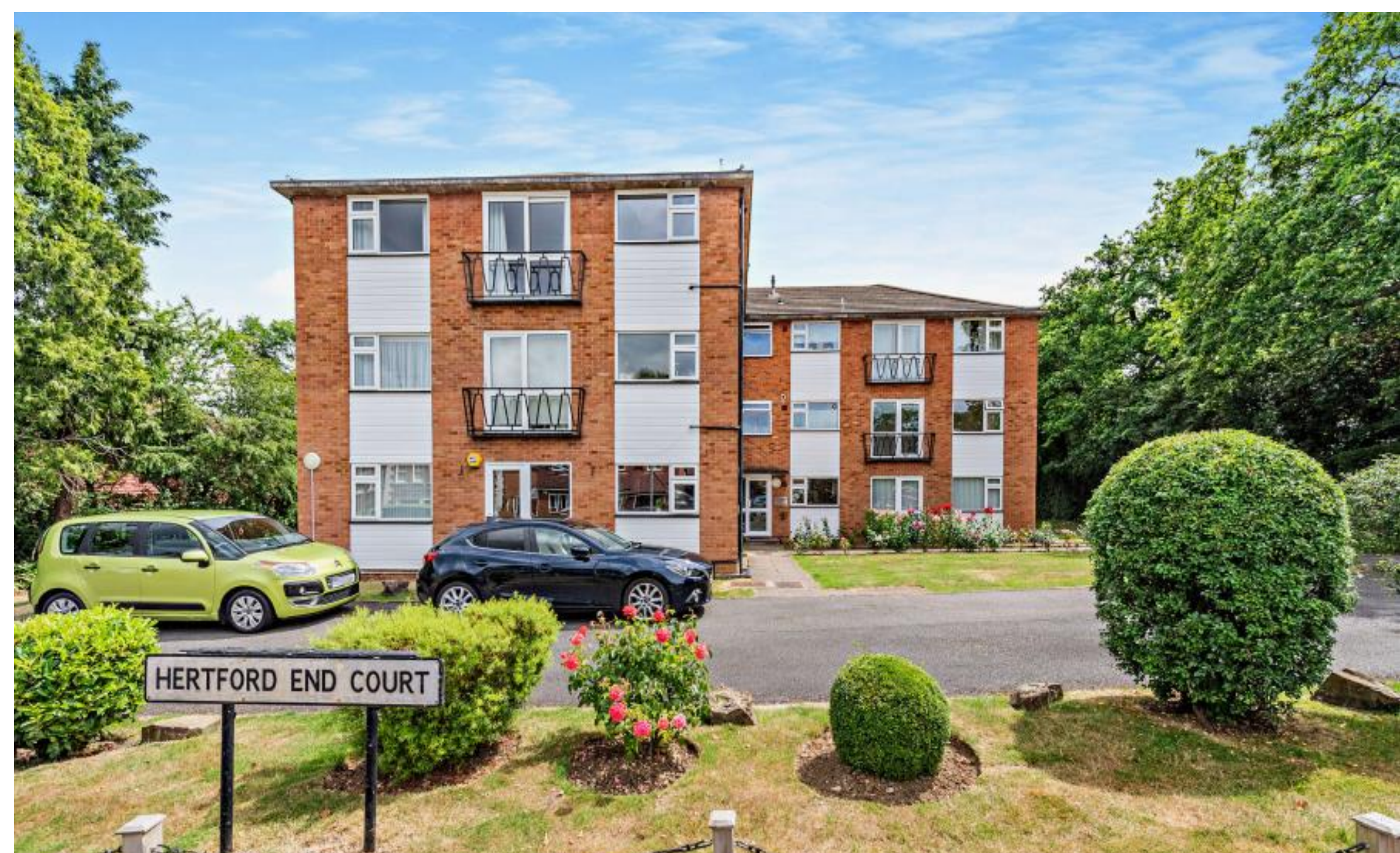
A well presented two bedroom apartment in the heart of Northwood Sandy Lodge Way, Northwood, HA6 2AW