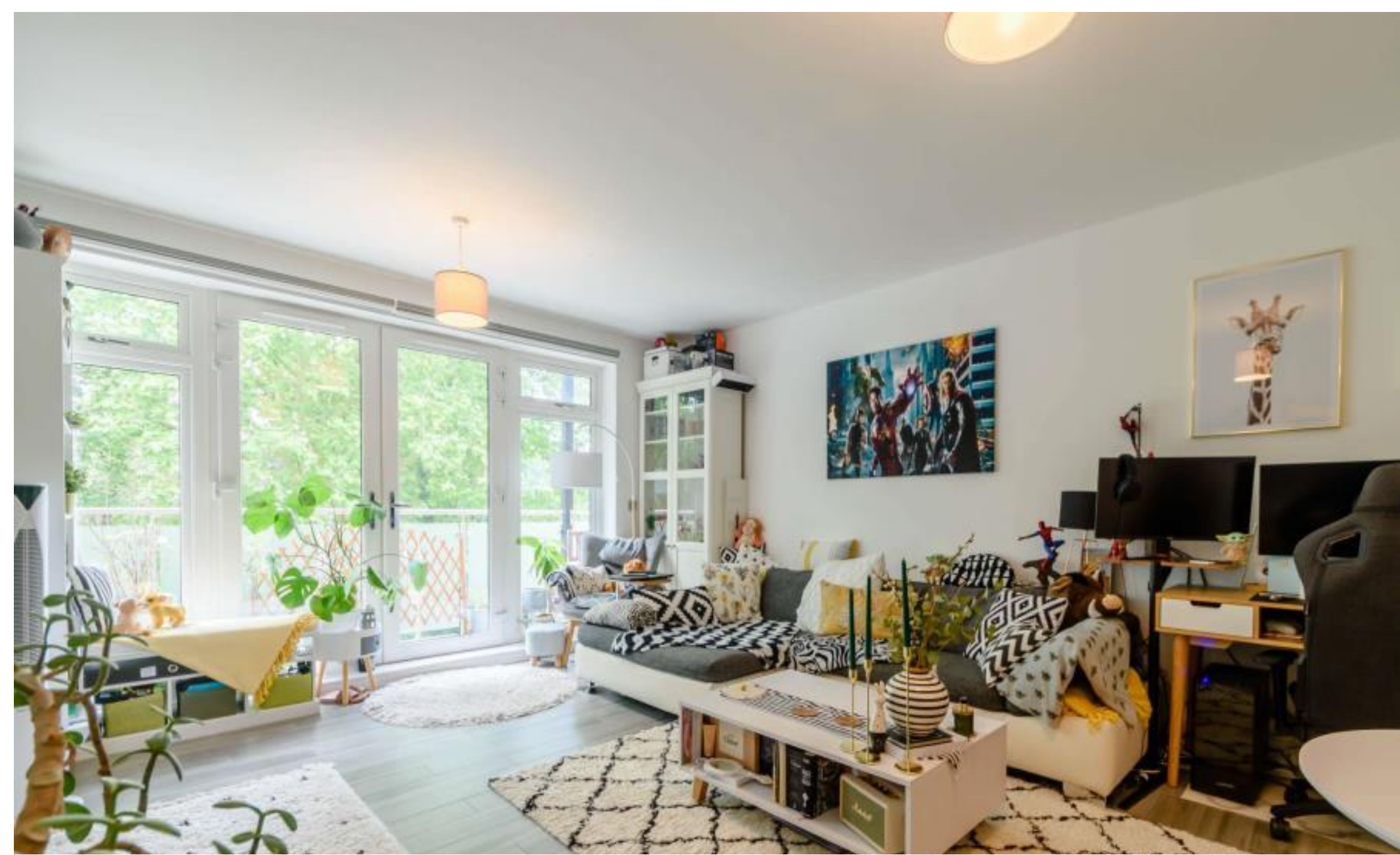
A two bedroom two bathroom first floor apartment within a luxury development Carew Road, Northwood, Middlesex HA6 3NJ