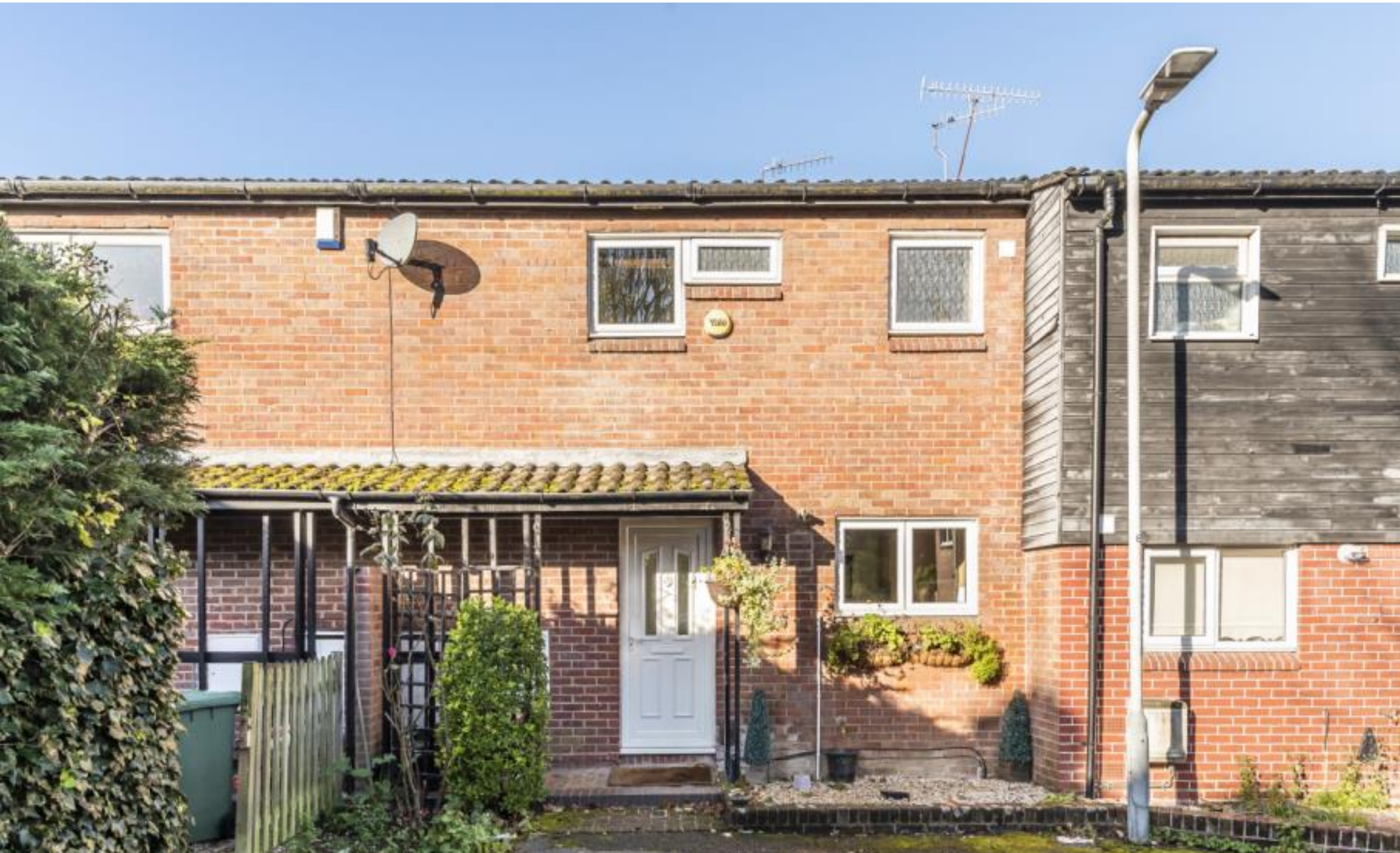
A well presented two bedroom mid terrace house Mezen Close, Northwood, HA6 2DP