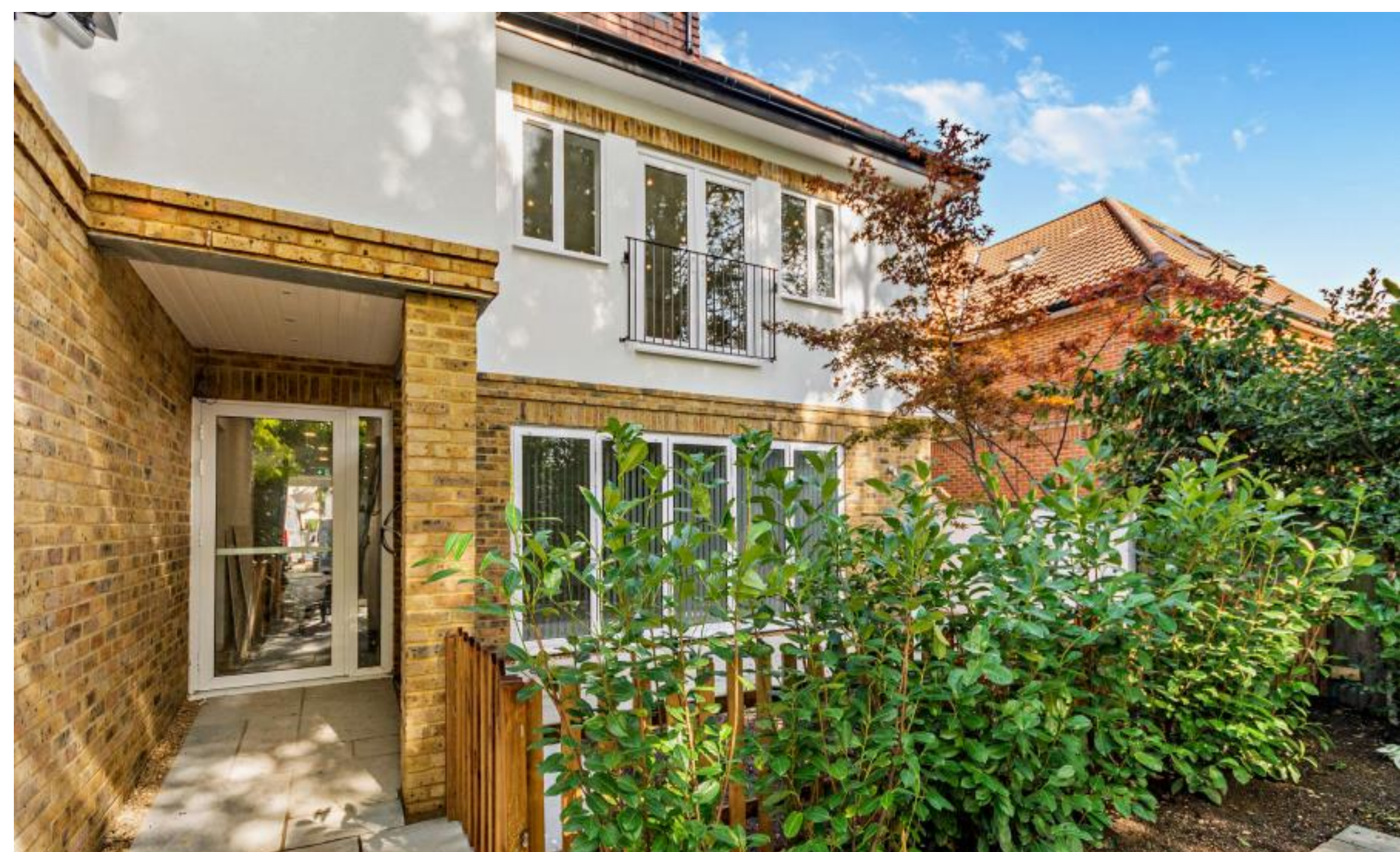
A two bedroom ground floor apartment with a terrace Swakeleys Road, Ickenham, UB10 8DL