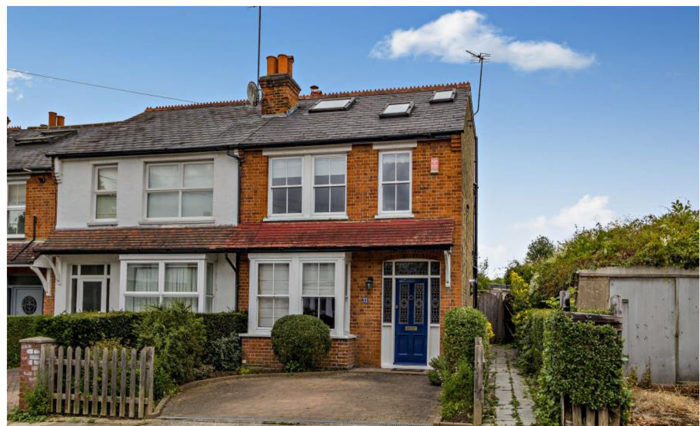
A charming three bedroom Victorian end of terraced house Reginald Road, Northwood, HA6 1EG