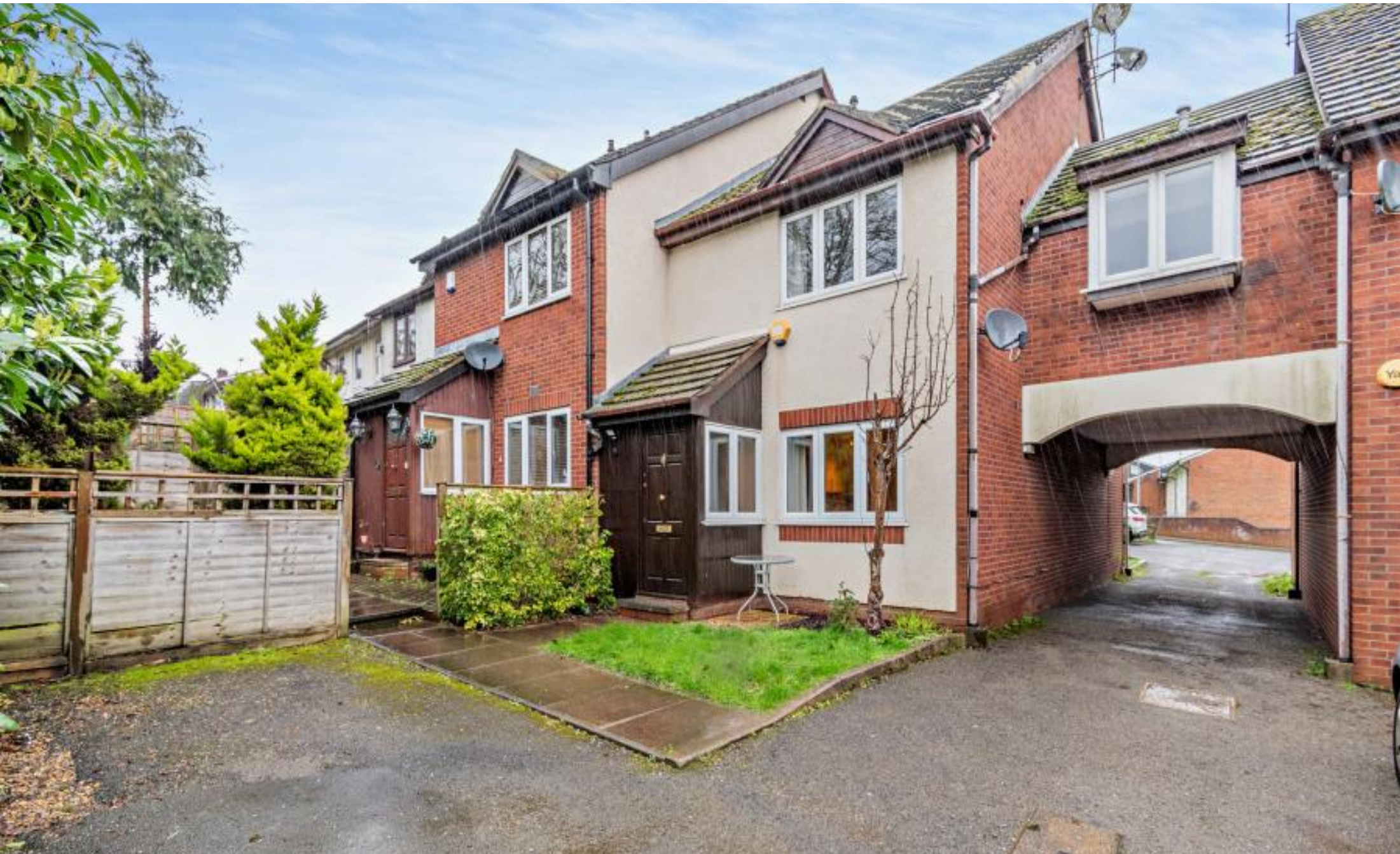
A two bedroom terraced home in a convenient location Fairfield Close, Northwood, Middlesex HA6 2UL