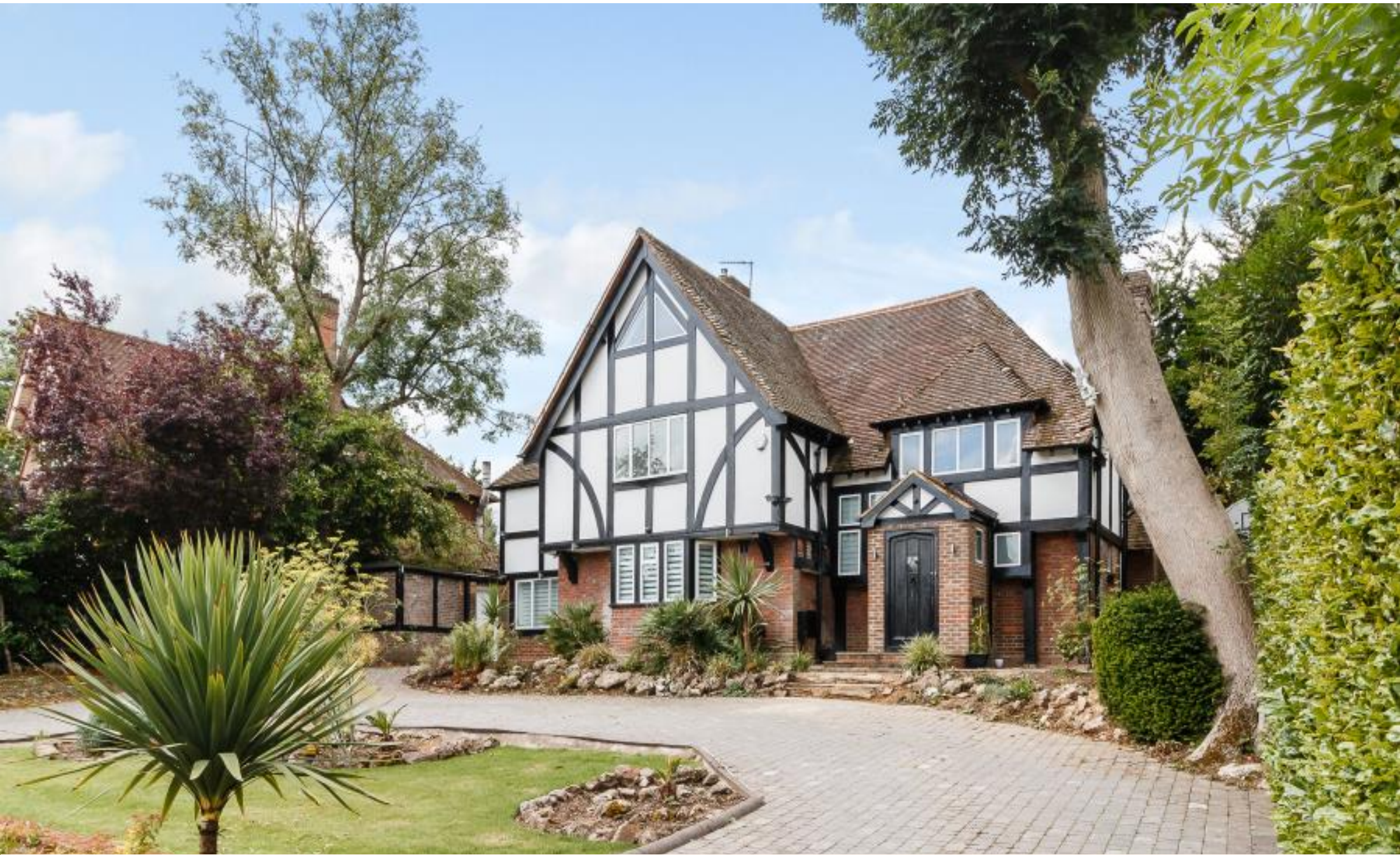
A Stunning Six Bedroom, Six Bathroom, Detached Family Home Astons Road, Northwood, Middlesex HA6 2LD