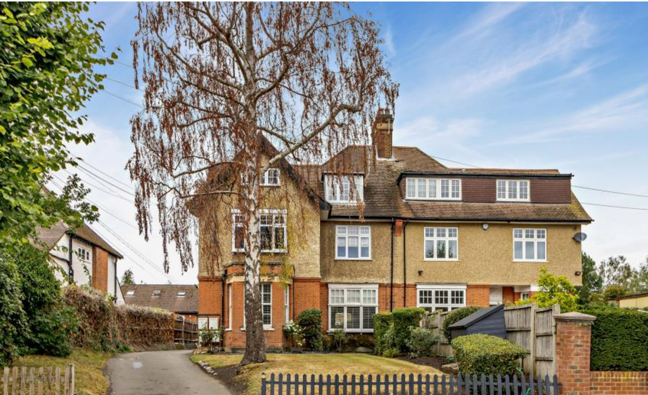
A town centre two bedroom ground floor maisonette with a private garden Murray Road, Northwood, HA6 2YL