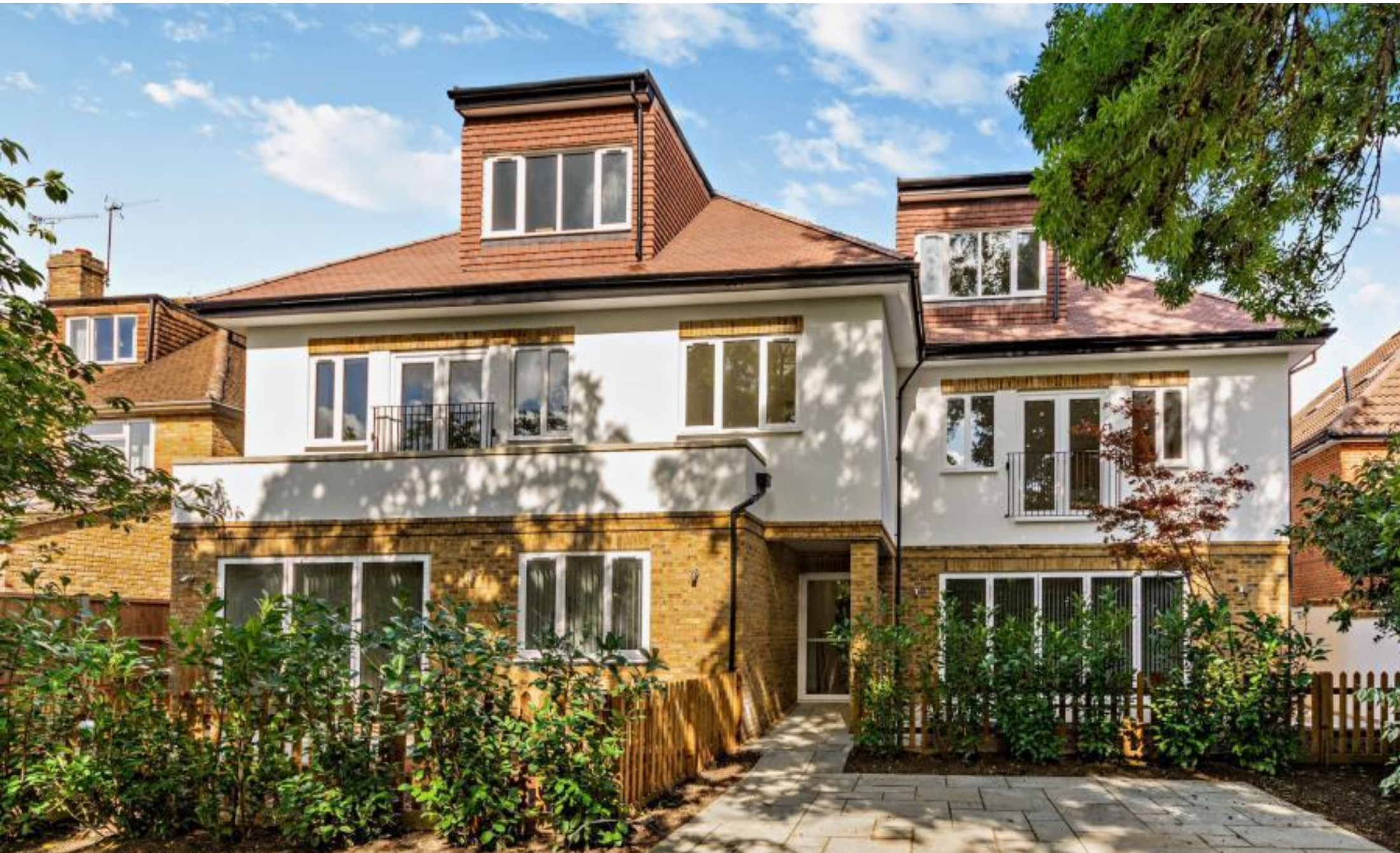
A TWO BEDROOM TWO BATHROOM FIRST FLOOR APARTMENT Swakeleys Road, Ickenham, UB10 8DL