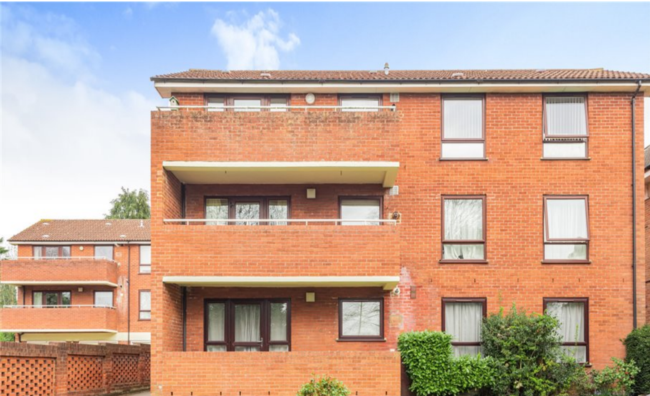
A bright and spacious two bedroom apartment in a sought after location Churchill Court, Northwood, Middlesex HA6 2RY