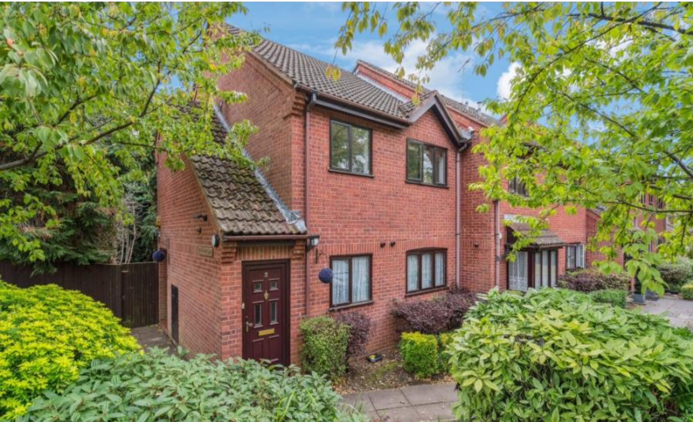
A two bedroom first floor maisonette on a popular road The Avenue, Northwood, HA6 2NQ