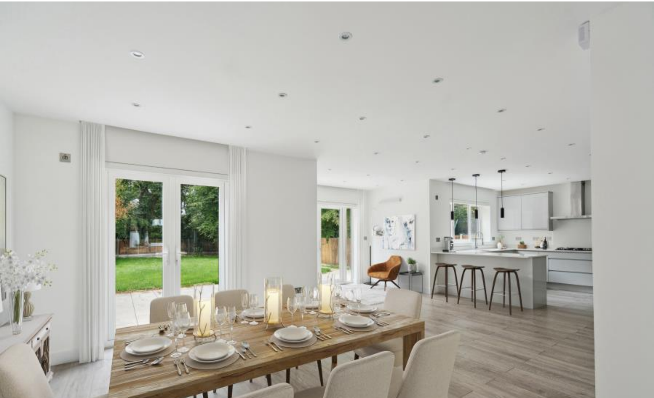
A refurbished seven bedroom, seven bathroom house on a sought after road St Marys Avenue, Northwood, Middlesex HA6 3AY