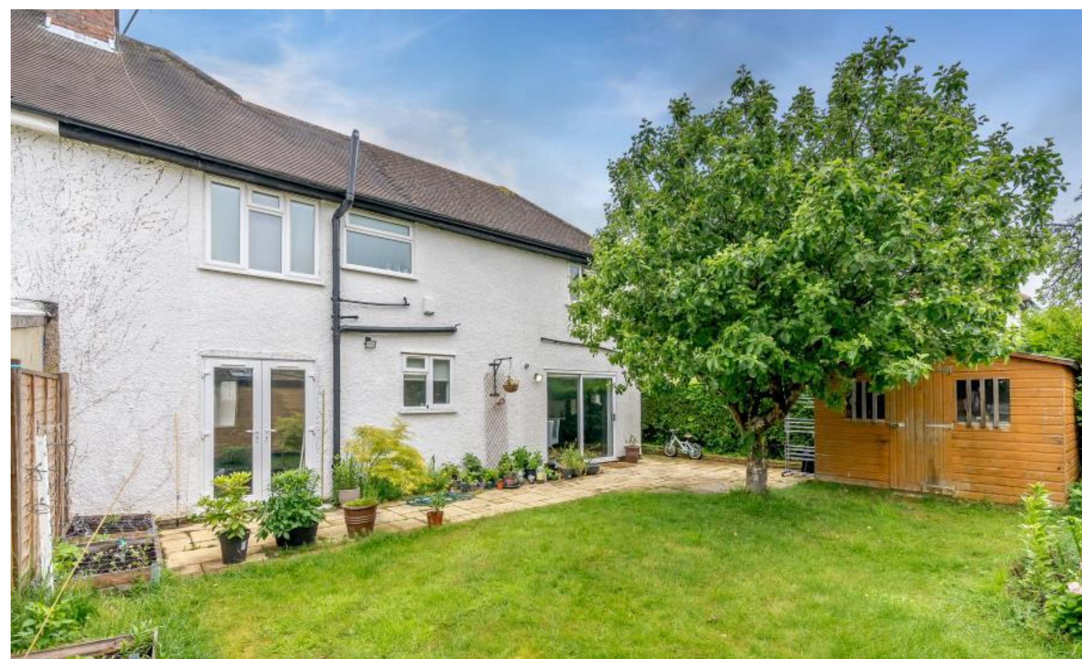
An attractive semi-detached three bedroom two bathroom family home Townsend Way, Northwood, HA6 1TF