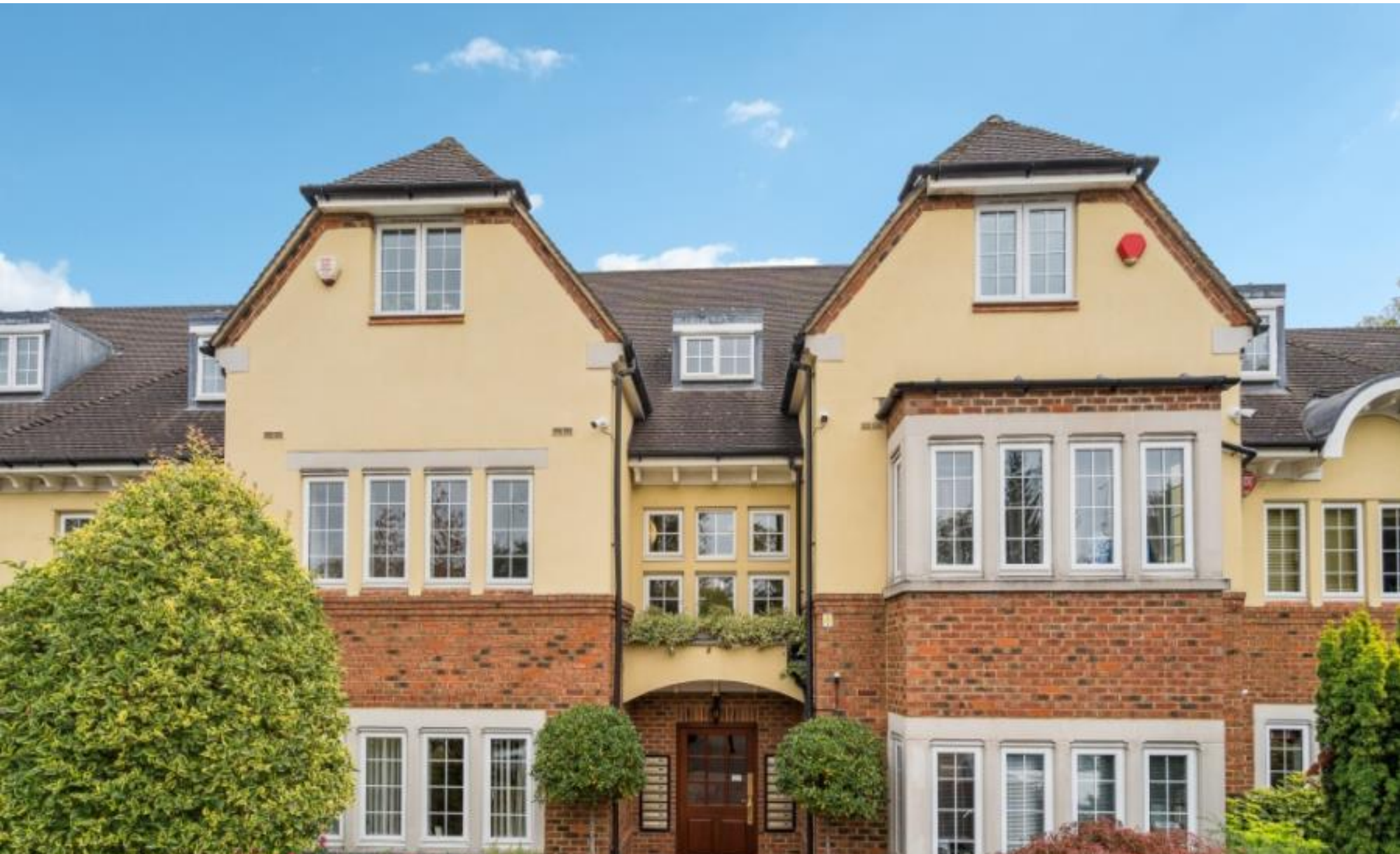
A three bedroom ground floor apartment in a gated development Ducks Hill Road, Northwood, HA6 2SG