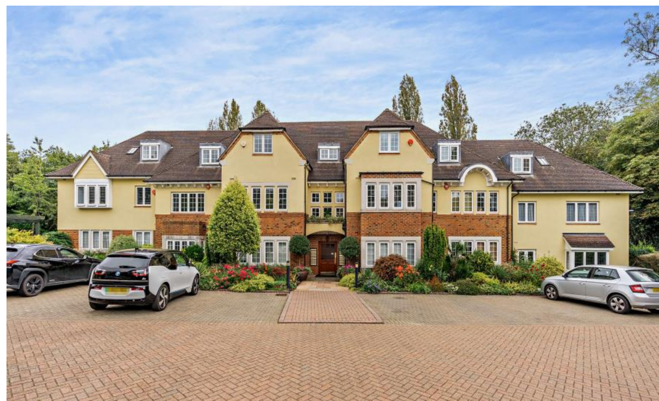
A three bedroom ground floor apartment in a gated development Ducks Hill Road, Northwood, HA6 2SG