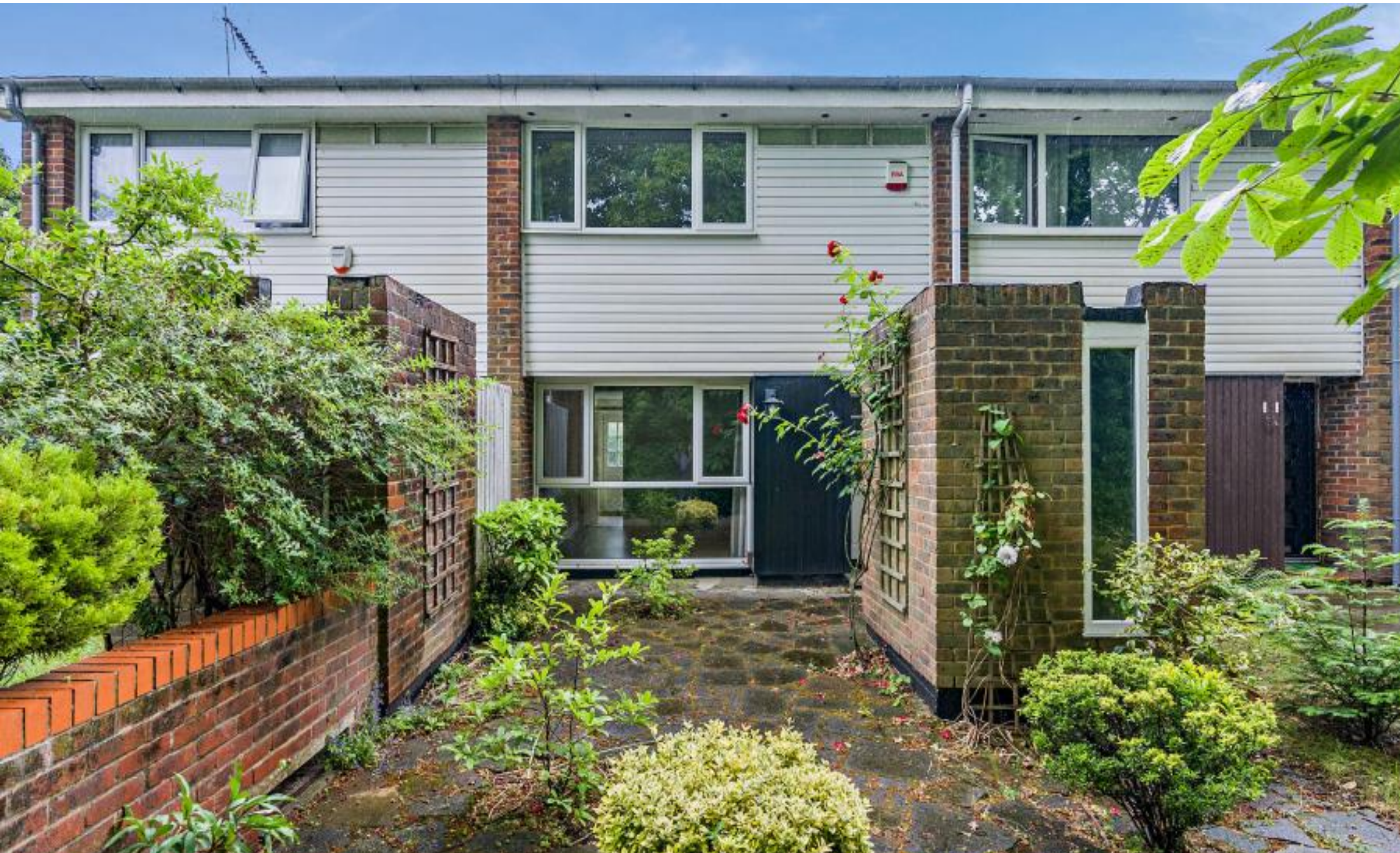
A two bedroom terraced house in a cul de sac location Hawkesworth Close, Northwood, HA6 2FT