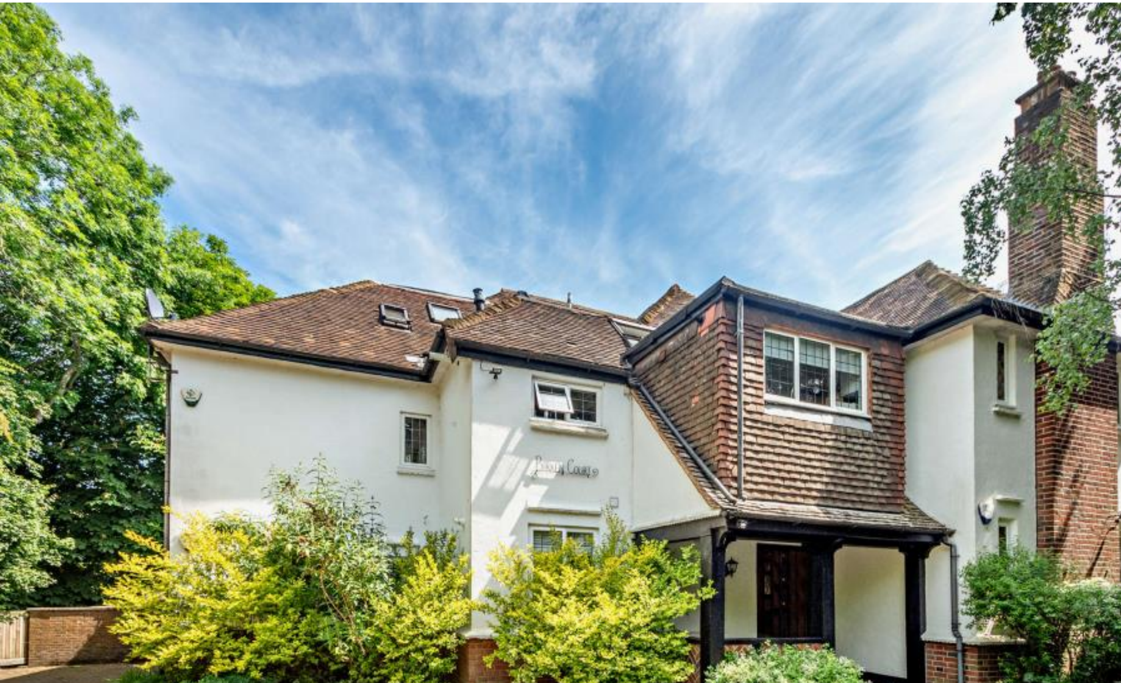
A spacious two bedroom apartment located in a exclusive development Rickmansworth Road,Northwood, HA6 2GY