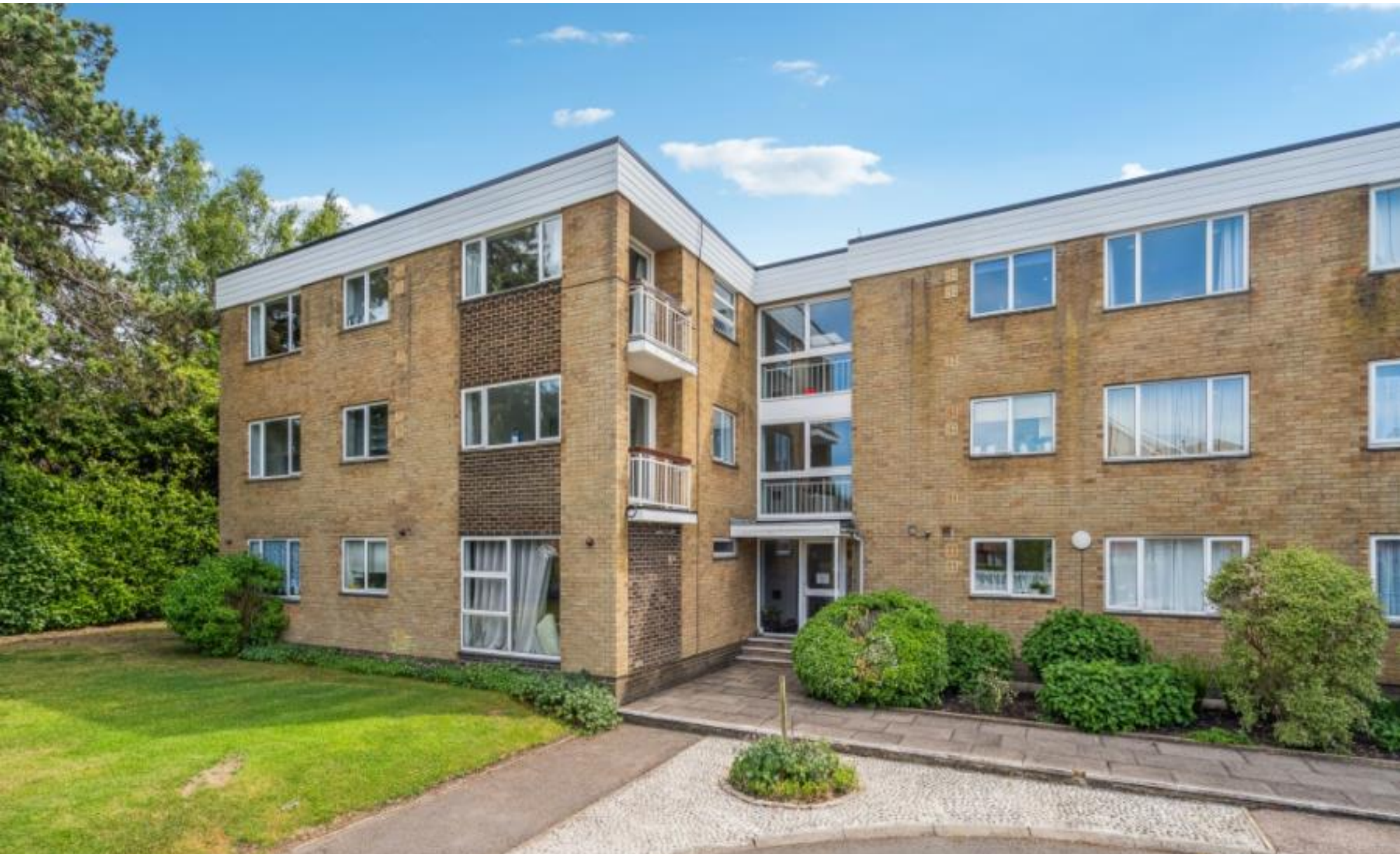
A Modern Two Bedroom Apartment In A Popular Residentail Location Eastbury Avenue,Northwood, HA6 3LQ