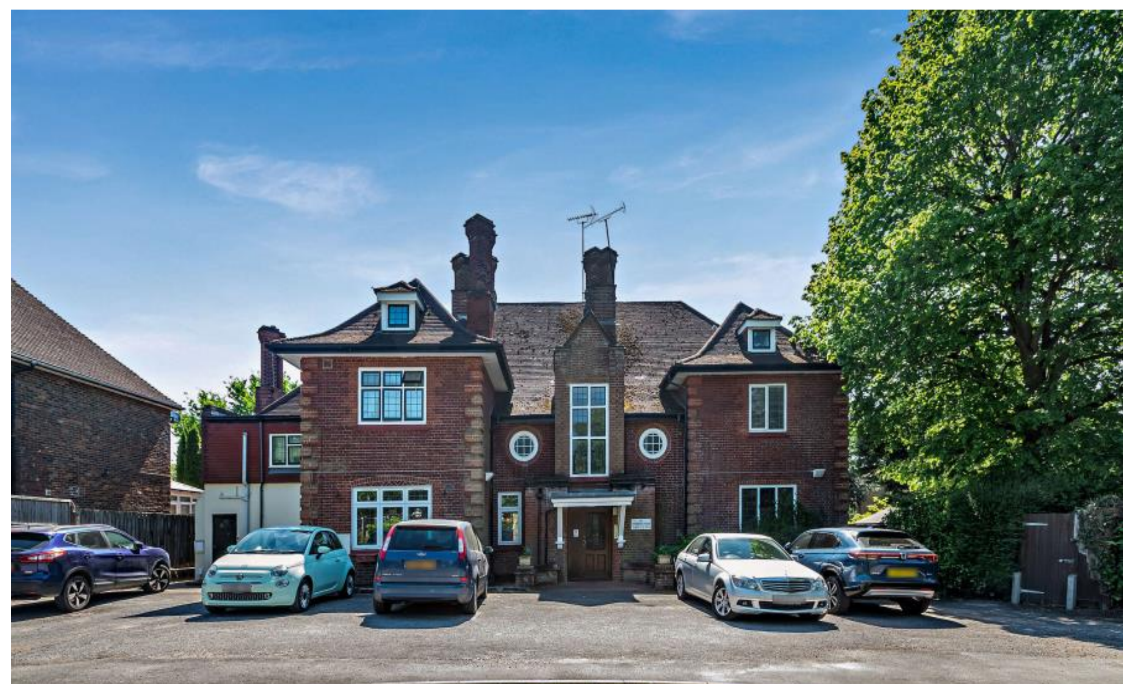
A three bedroom renovated ground floor apartment with private garden Frithwood Avenue, Northwood, HA6 3LX