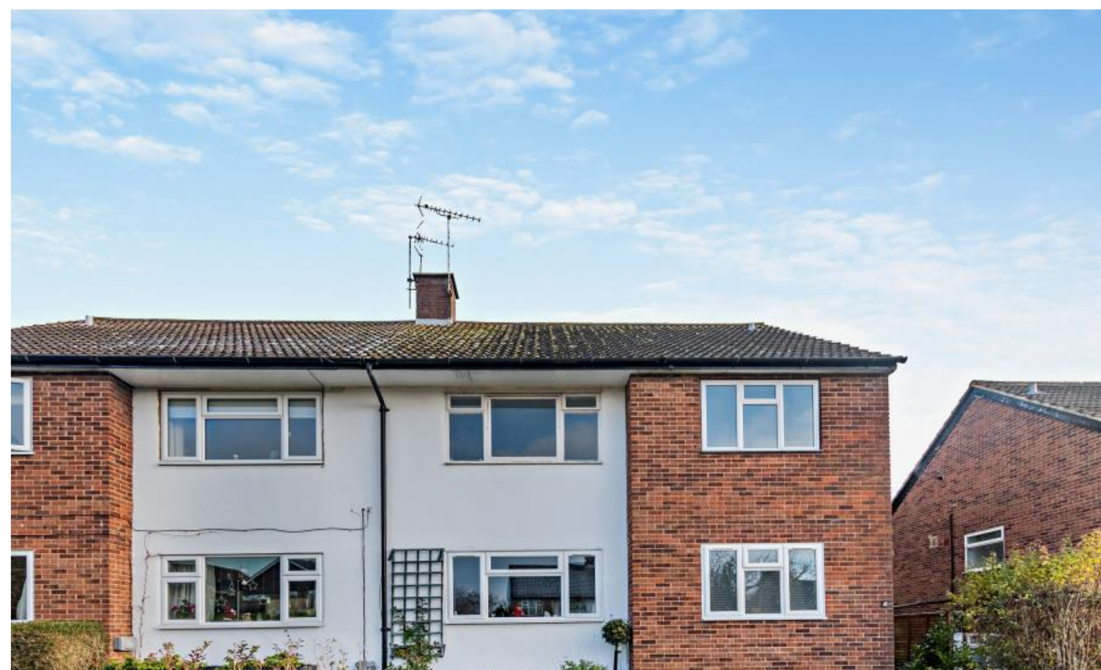
A recently refurbished spacious two bedroom first floor maisonette Green Street, Chorleywood, WD3 5QS