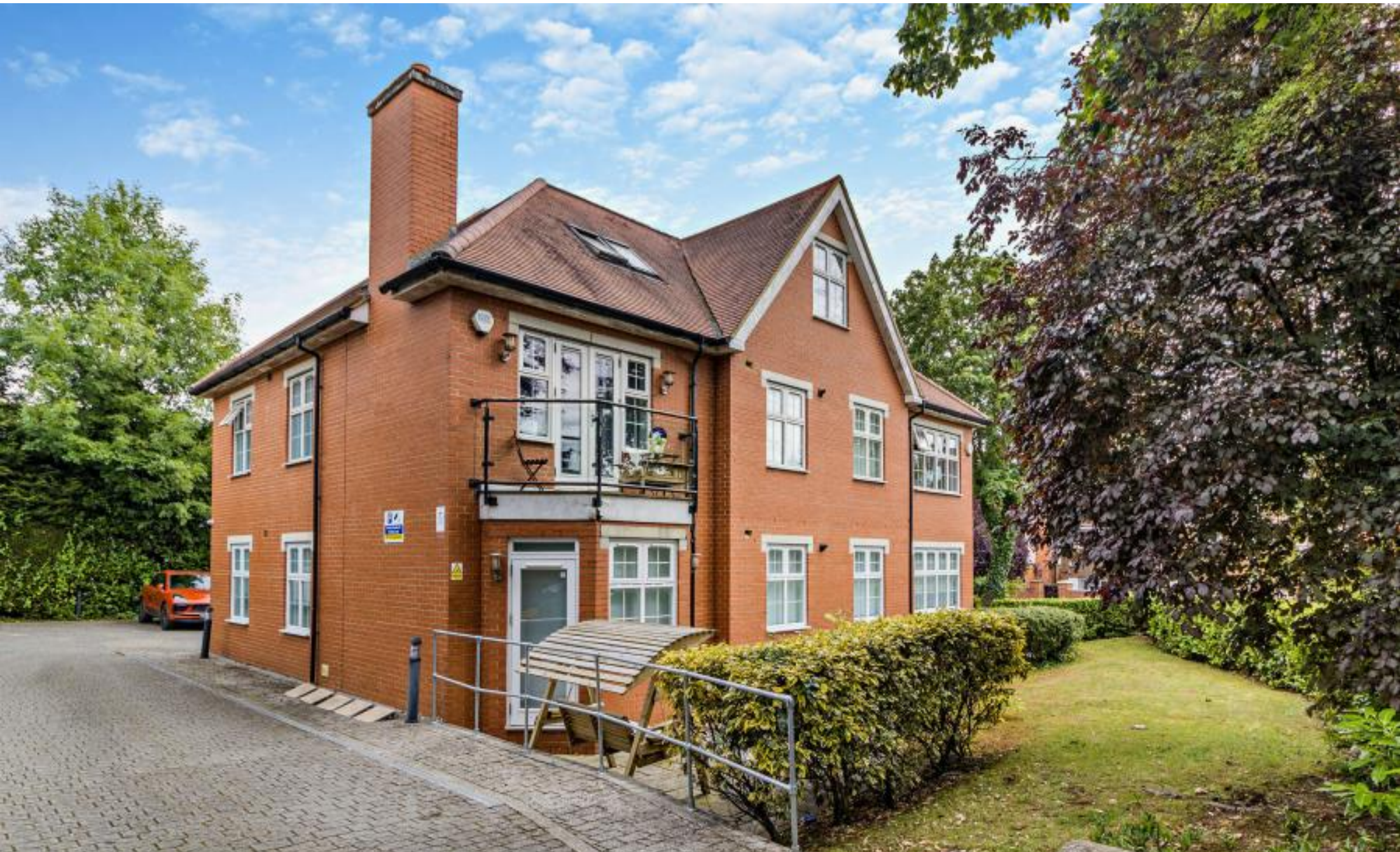
A stylish two bedroom, two bathroom apartment close to Northwood town centre Watford Road, Northwood, HA6 3FE