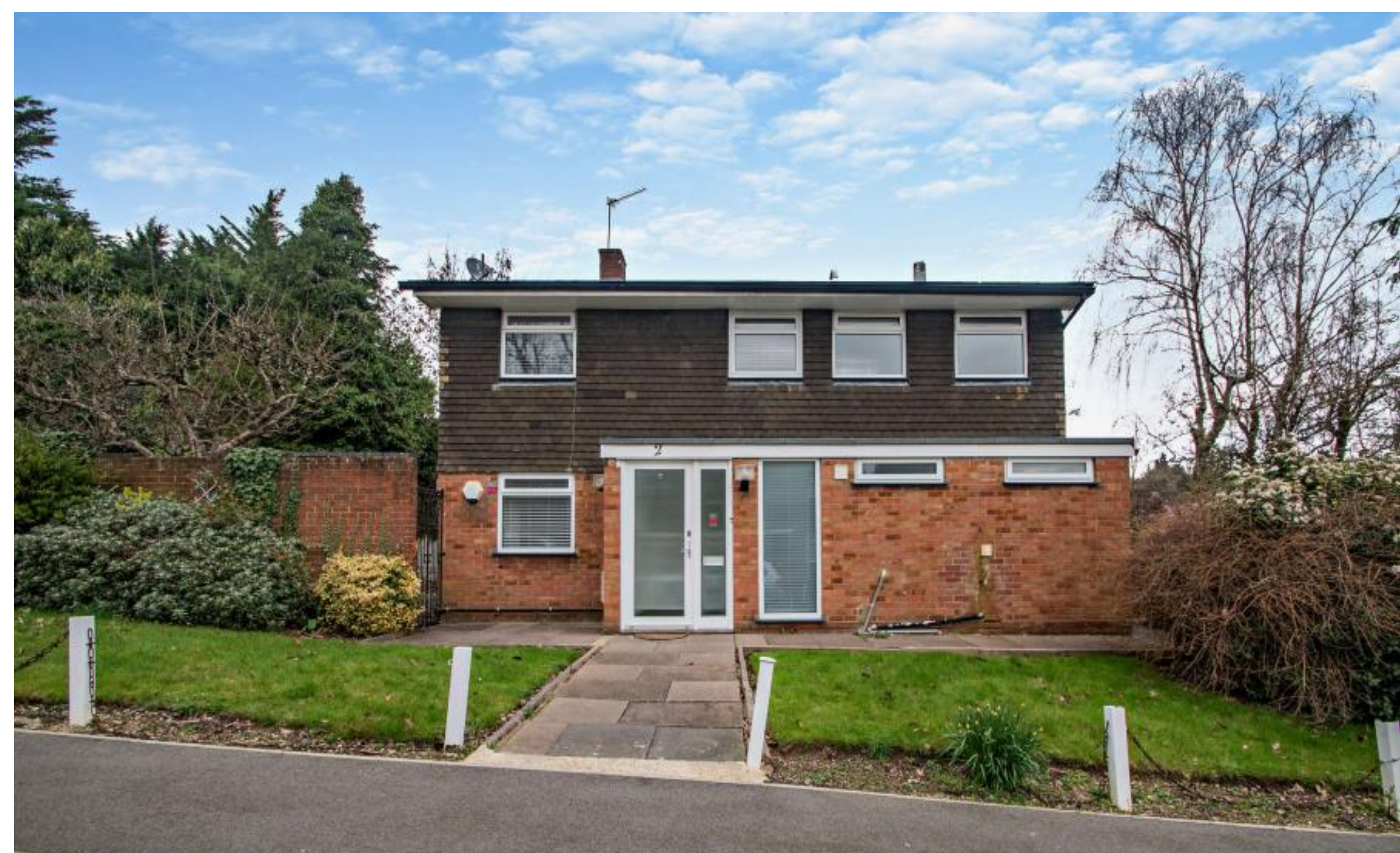
A four bedroom three bathroom family home in a sought after location Brookdene Drive, Northwood, HA6 3NS