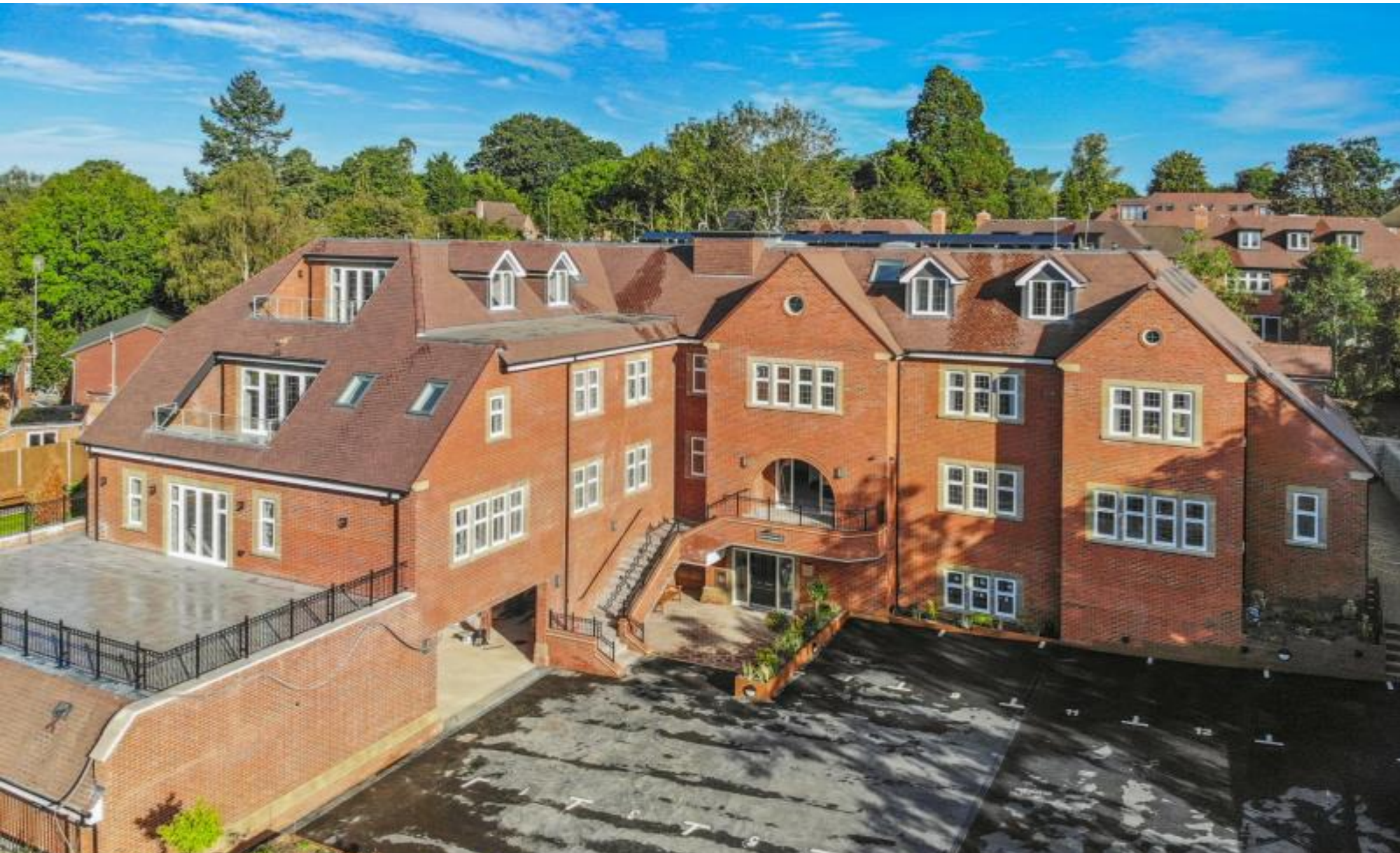
A brand three bedroom, three bathroom apartment in a gated development Green Lane, Northwood, Middlesex HA6 2HQ