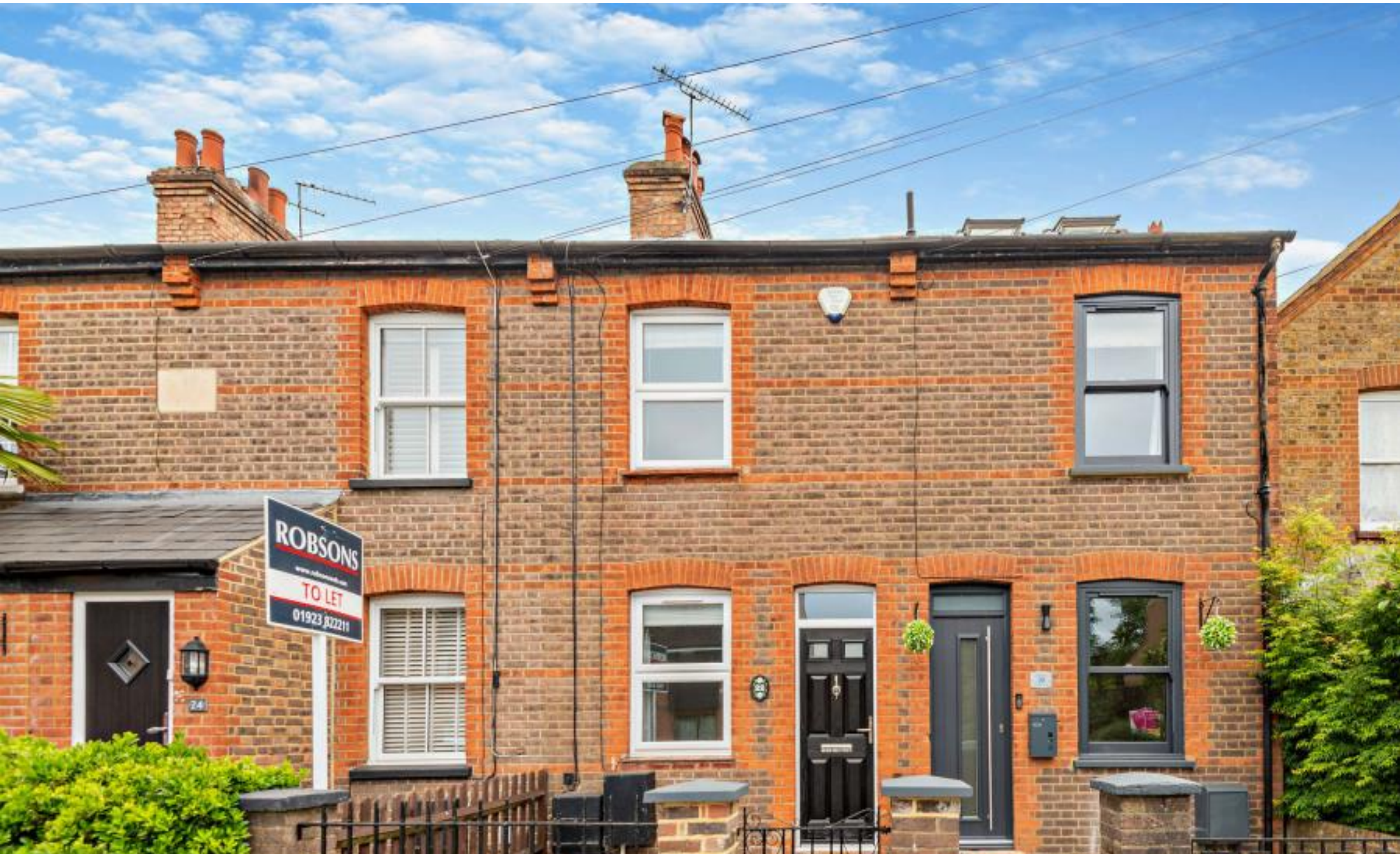
A two bedroom cottage in a convenient location Church Lane,Rickmansworth, WD3 8HD