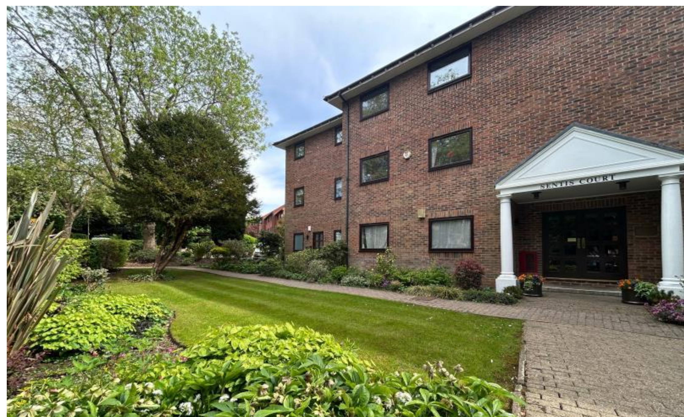
A recently renovated two bedroom ground floor apartment Carew Road, Northwood, HA6 3NG