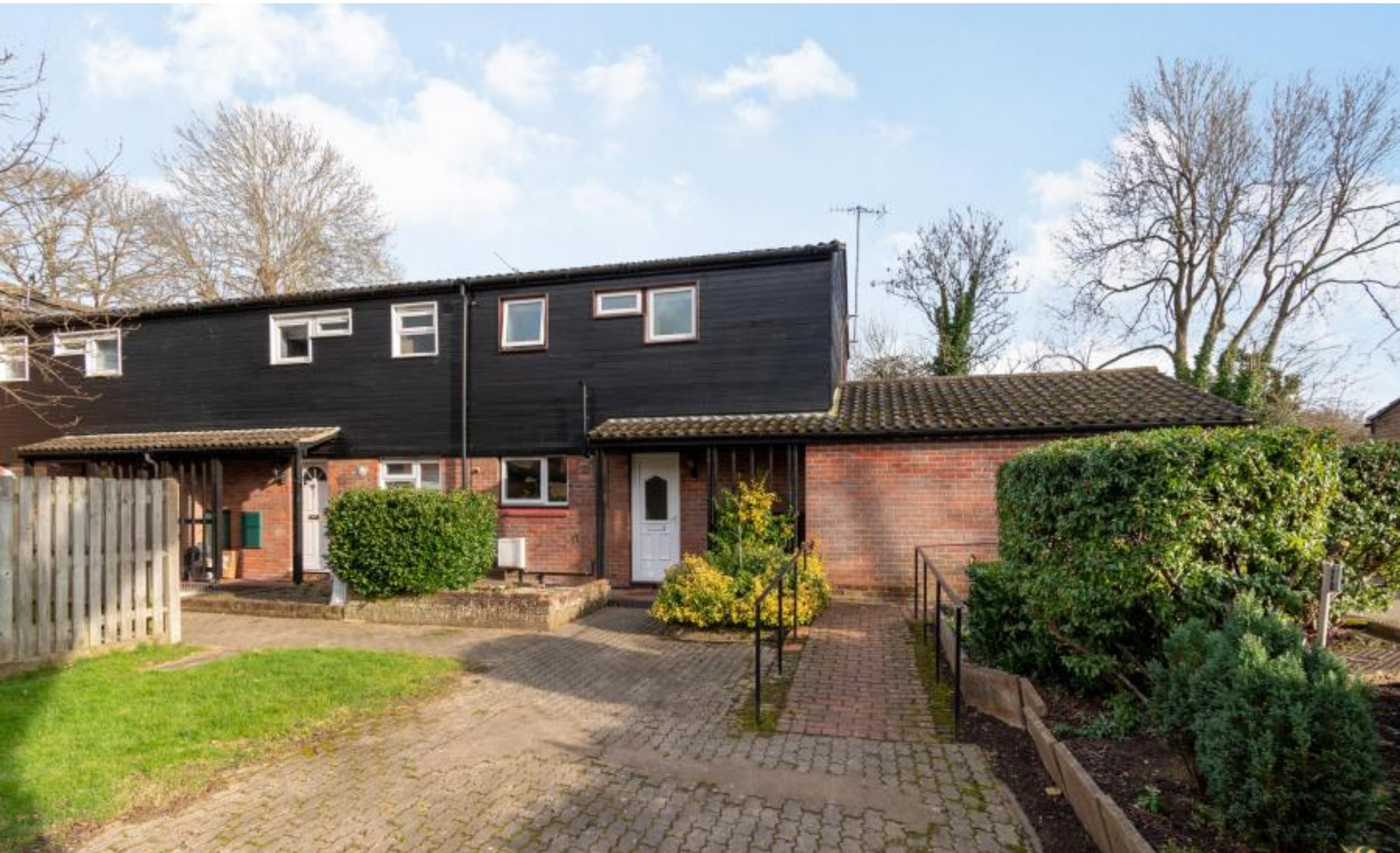
A well presented two bedroom family home set in a quite location Mezen Close, Northwood, Middlesex HA6 2DP