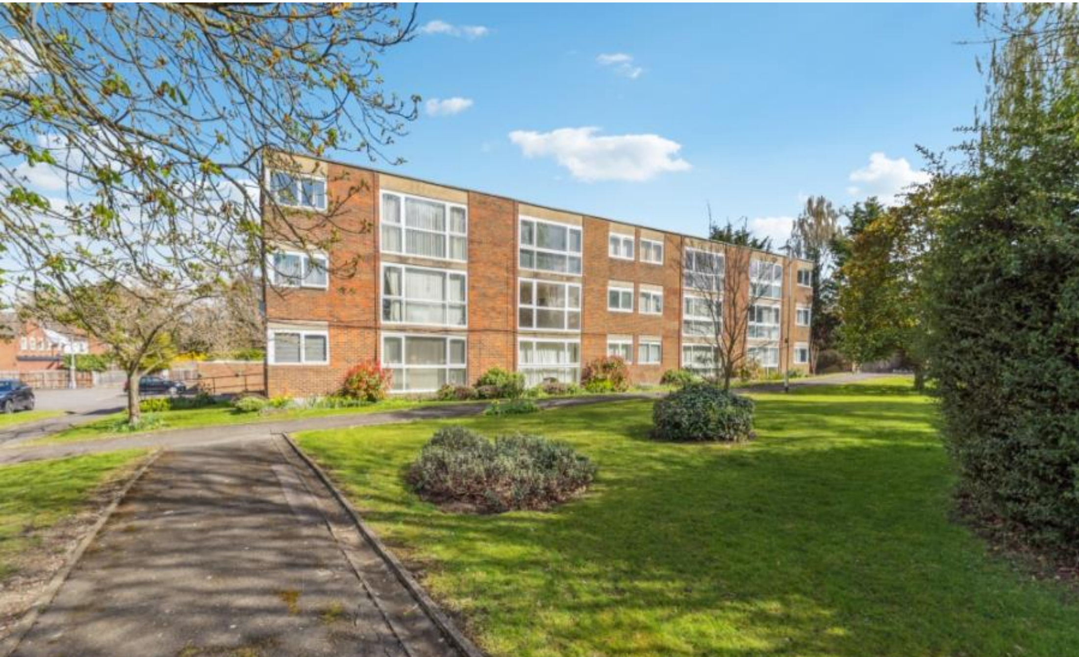
A refurbished two bedroom first floor apartment Hawkesworth Close, Northwood, HA6 2FT