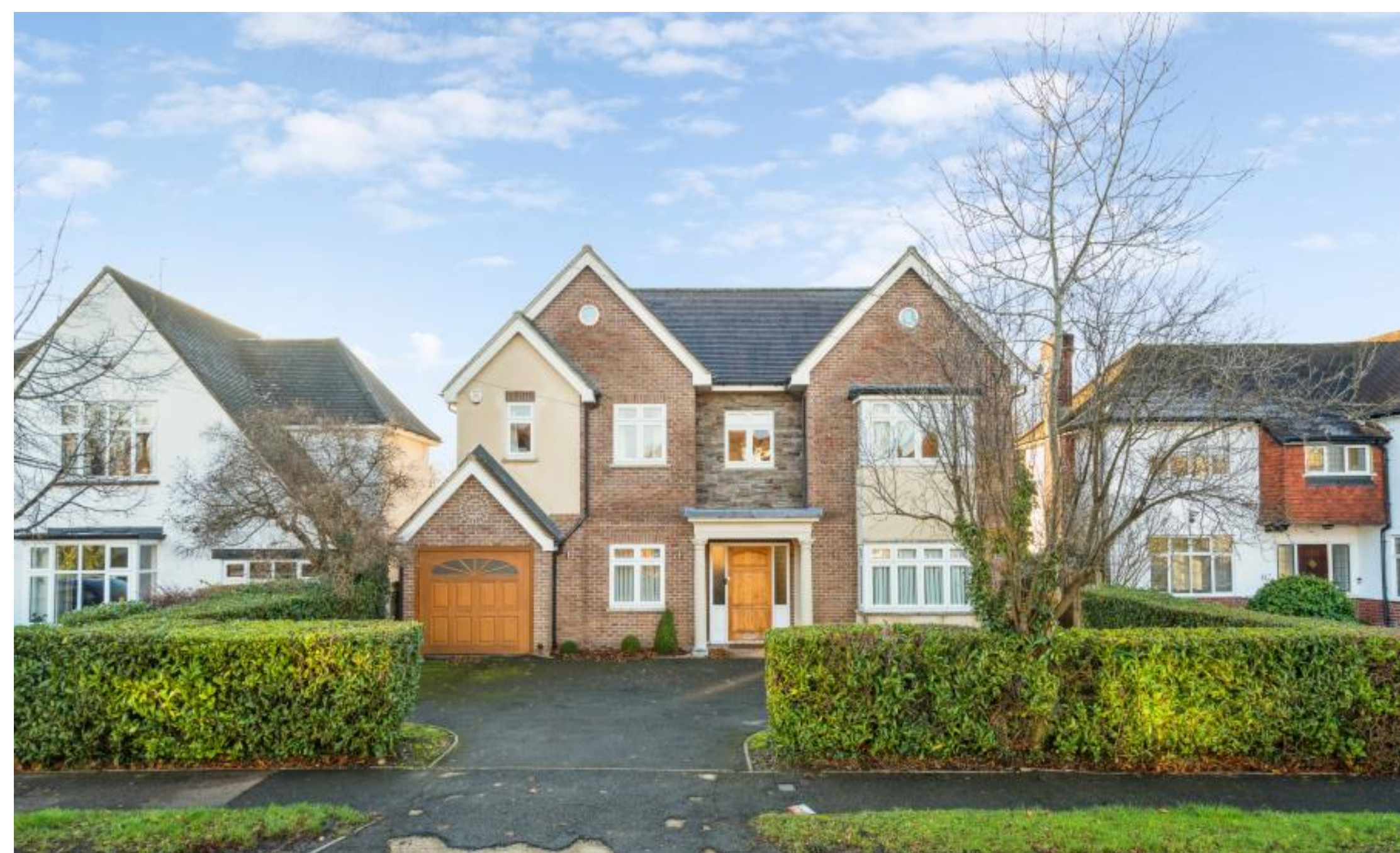
A five bedroom detached family home on the Eastbury Farm Estate Bourne End Road, Northwood, Middlesex HA6 3BP