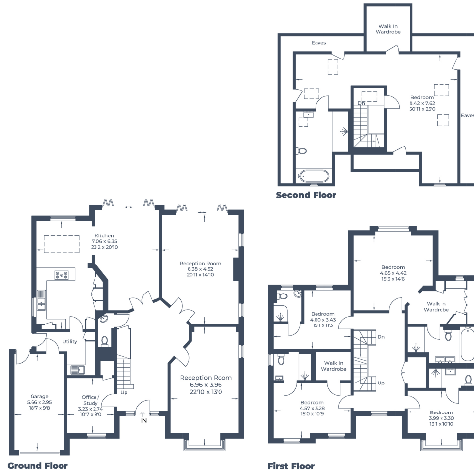
Illustration for identification purposes only, measurements are approximate, not to scale. © CJ Property Marketing Produced for Robsons