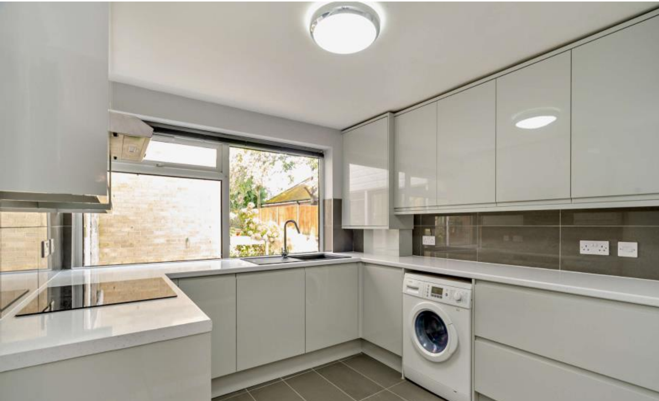
A purpose built two bedroom ground floor apartment Fairacre Court, Northwood, Middlesex HA6 2YH