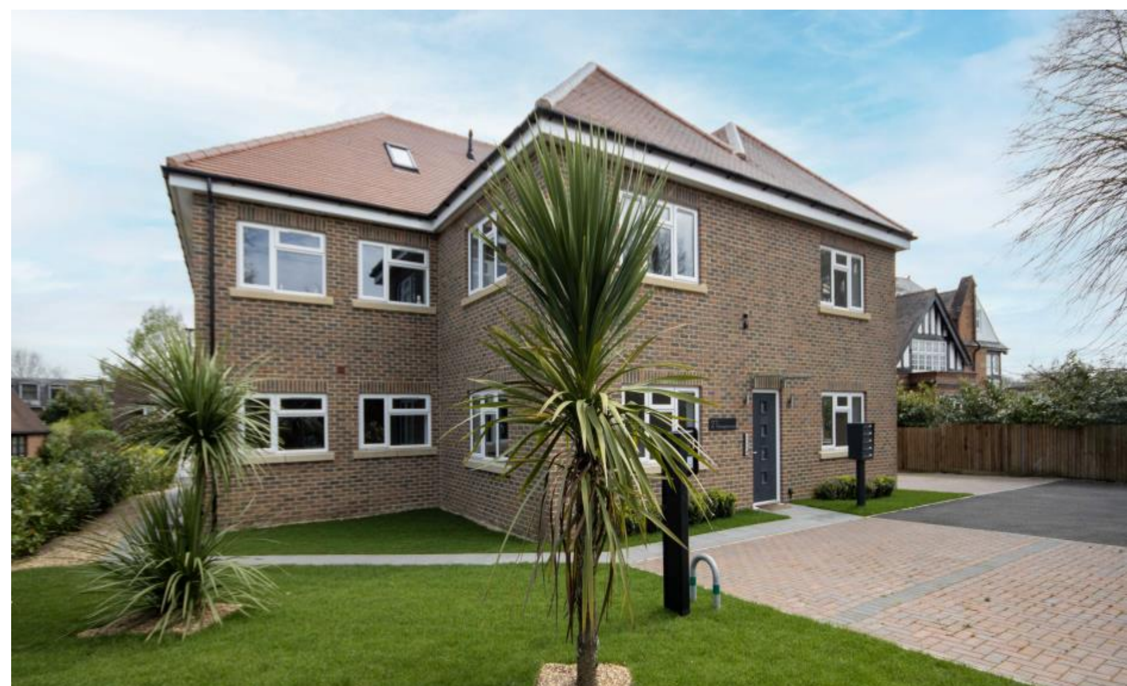
A luxury three bedroom two bathroom ground floor apartment Ducks Hill Road, Northwood, HA6 2NW