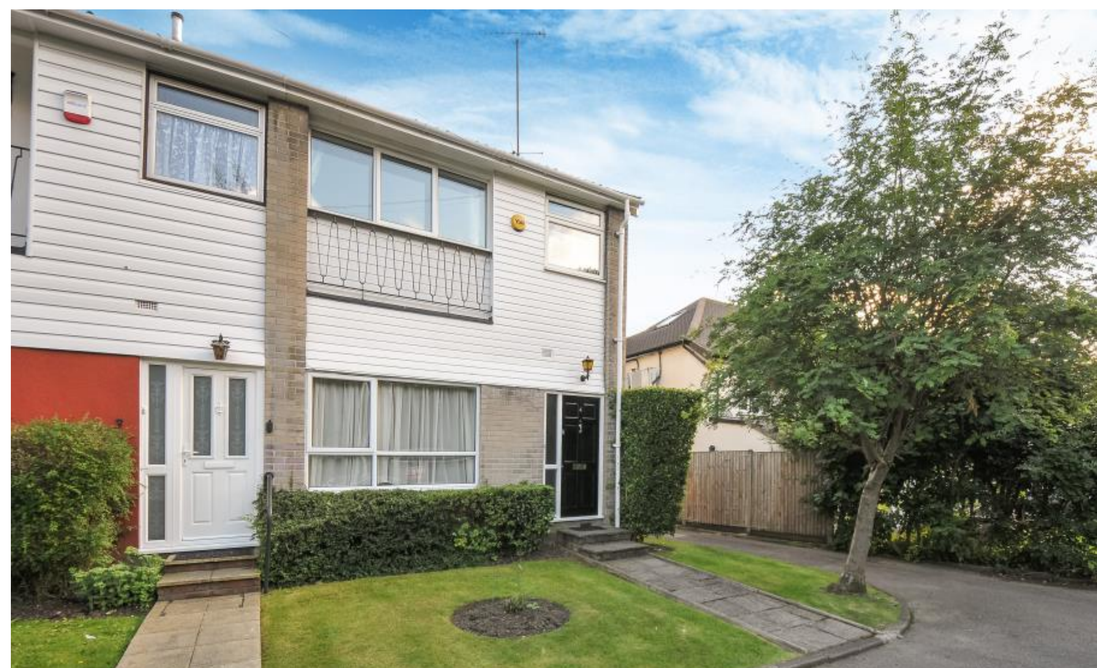
A three bedroom end of terrace family home Rickmansworth Road, Northwood, Middlesex HA6 2QQ