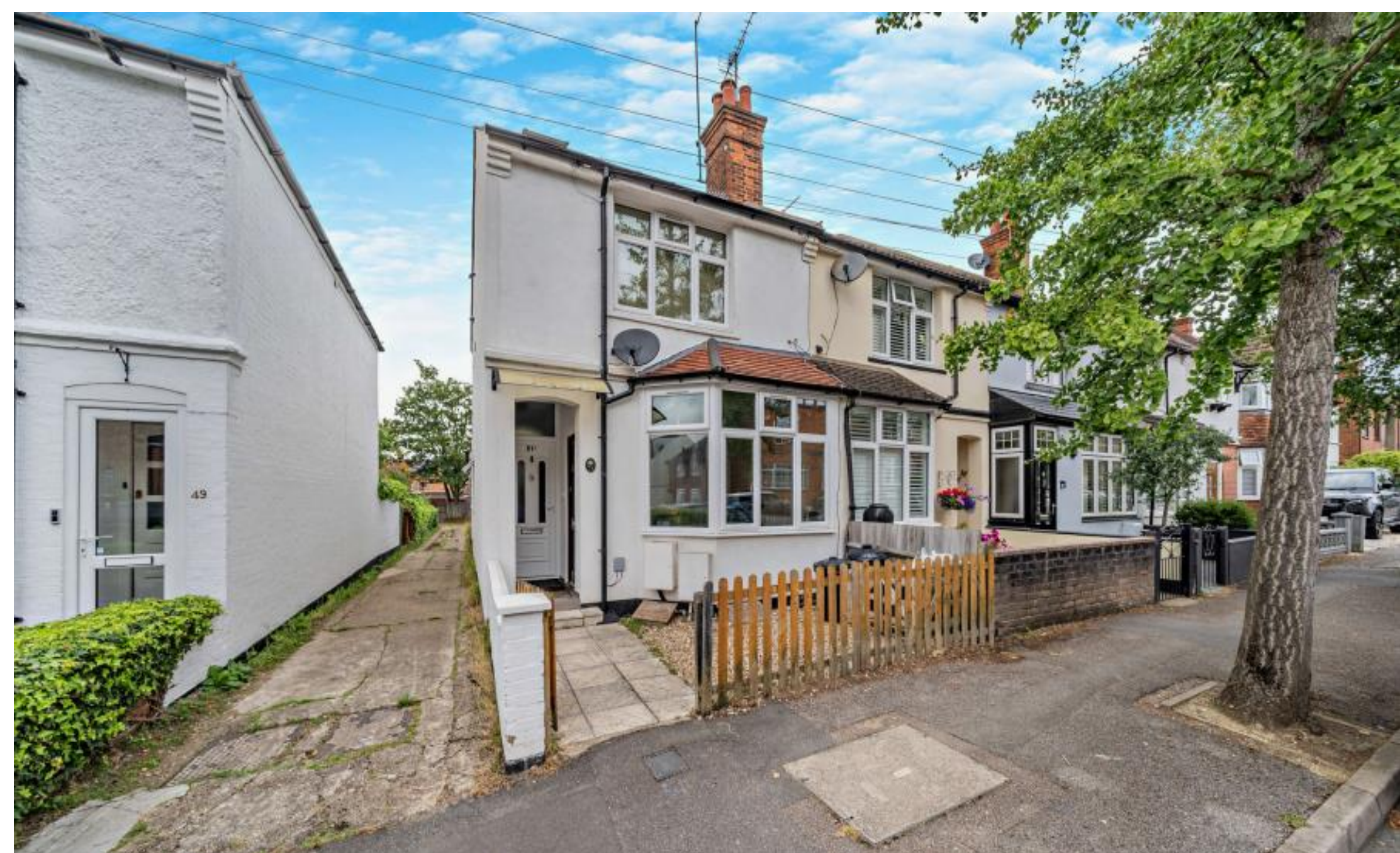
A two bedroom ground floor apartment with private garden Hilliard Road, Northwood, HA6 1SJ