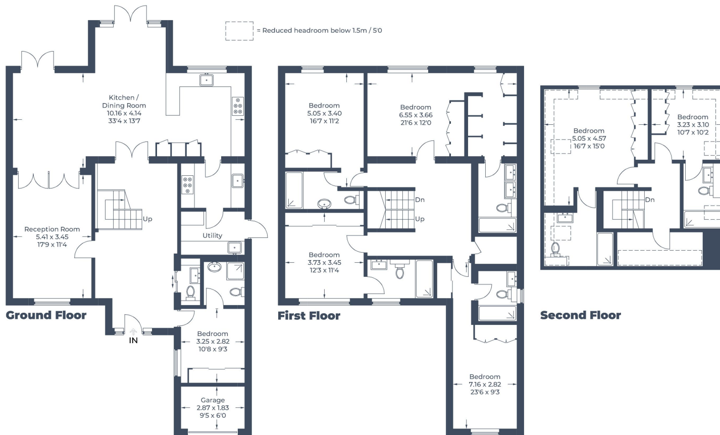
Illustration for identification purposes only, measurements are approximate, not to scale. © CJ Property Marketing Produced for Robsons

Approximate Gross Internal Area Ground Floor = 121.1 sq m / 1,303 sq ft First Floor = 115.9 sq m / 1,247 sq ft Second Floor = 61.6 sq m / 663 sq ft Garage = 5.2 sq m / 56 sq ft Total = 303.8 sq m / 3,269 sq ft