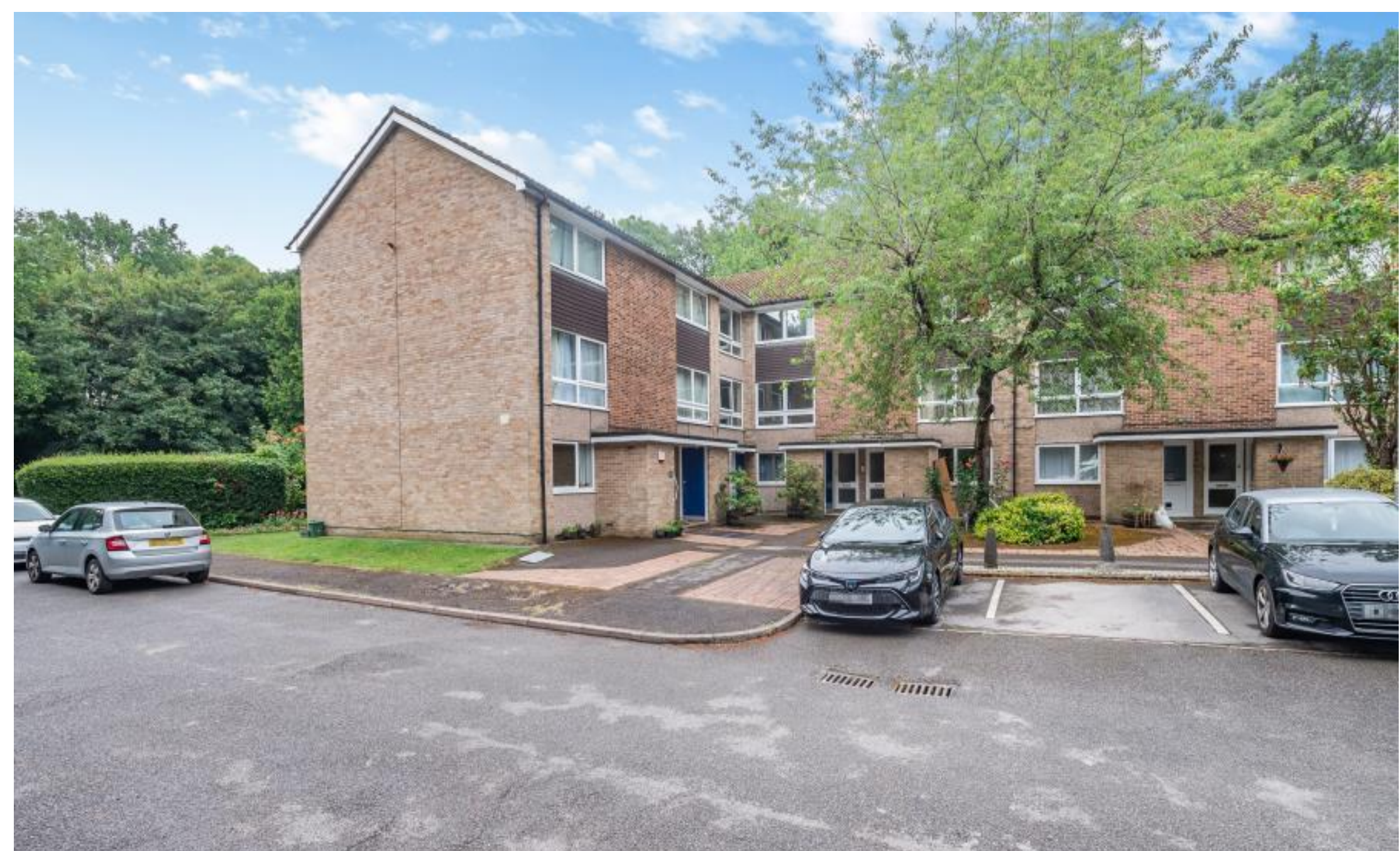
A two bedroom duplex maisonette Langland Court, Northwood, Middlesex HA6 2NH