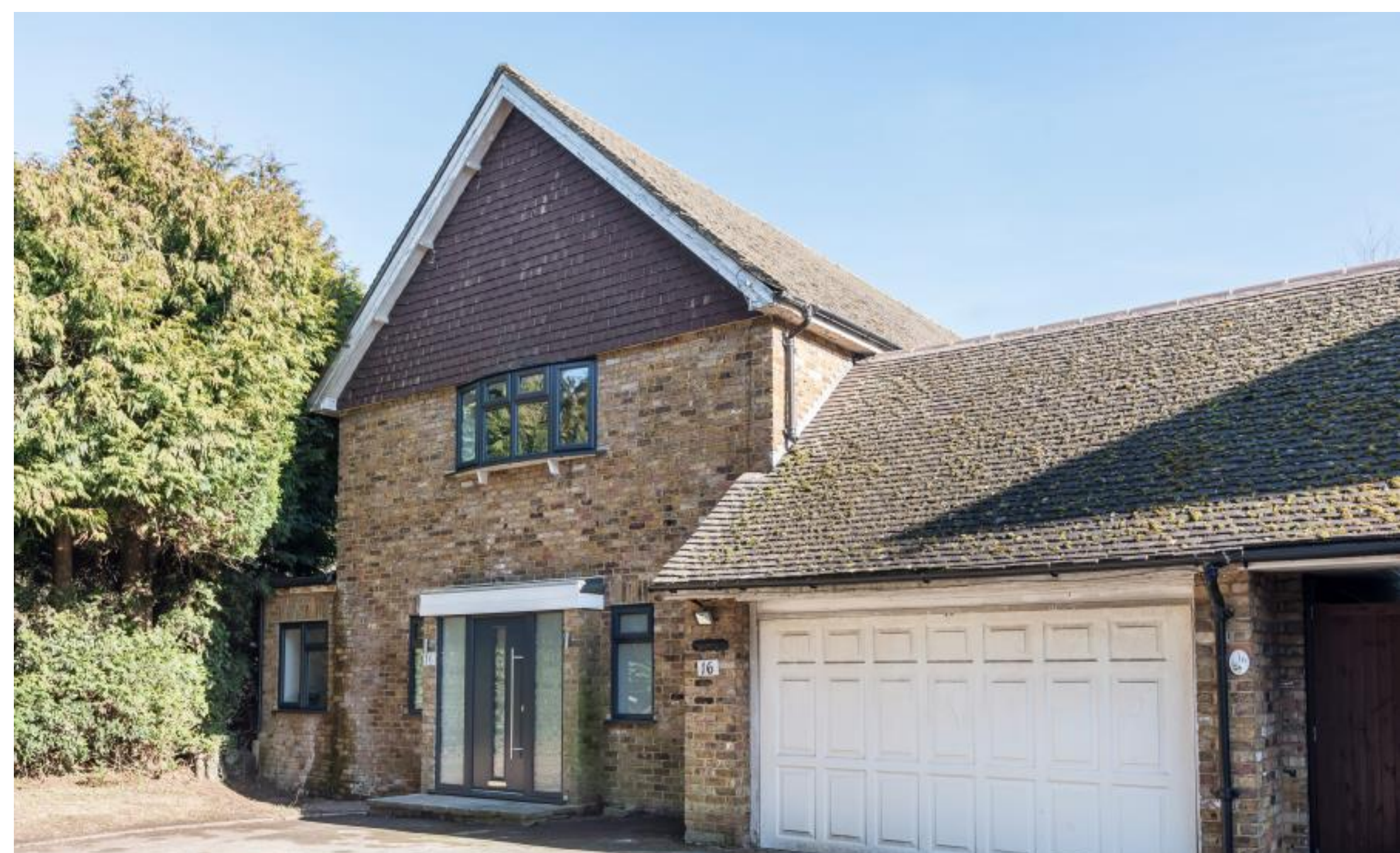
A four bedroom detached family home in a sought after location Batchworth Heath, Rickmansworth, Hertfordshire WD3 1QB